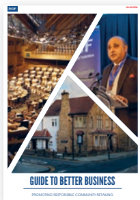
PUBLISHERS OF THE SGF ANNUAL HANDBOOK