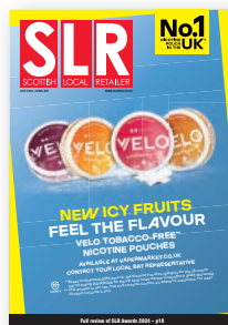
FALSE FRONT COVER ADVERTISING