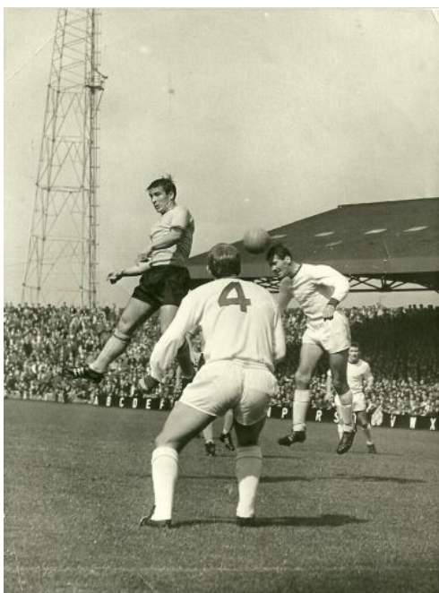
Pylons at Boothferry Park: v. Scunthorpe August, 1965