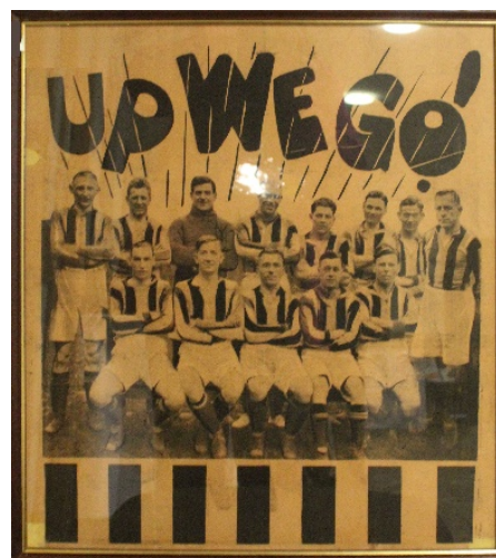
What legends may be here on a poster from 1933?

From a heritage and historical point of view there are serious omissions as there are no pre 1939 players being considered. Something the Senior Tigers may want to take up with the club in the future. When we get the Biographies on line we may be able to gauge better who should be included from the first 35 years of the club's history. (Currently you can view the biographies of the players by visiting www.oncloudseven.com . Plus there are a few books written about City's history which are very interesting.