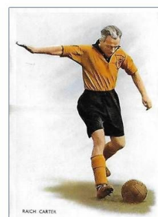
Horatio S Carter – Inside Right