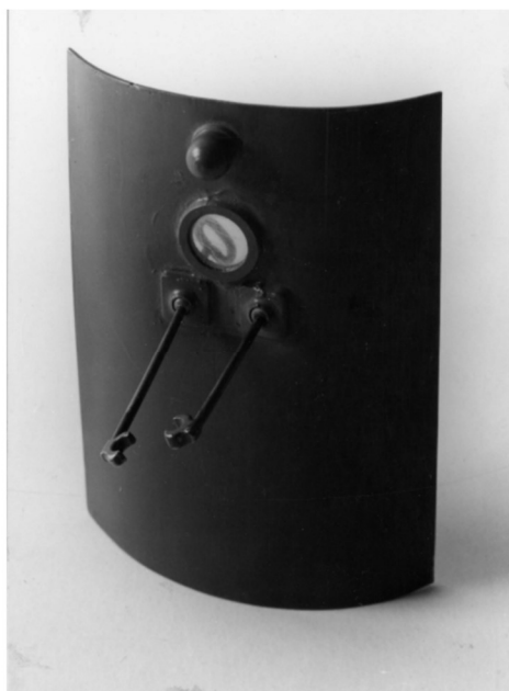
Window in model, detail, of the tube with two control arms.

The salvage company Octopus had succeeded in rescuing a ship from a depth that had previously been considered impossible. Nya Dagligt Allehanda wrote, among other things: "The proudest salvage feat, which has been performed so far, has today been completed".