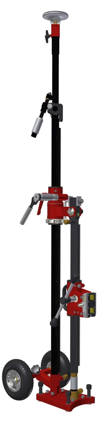
The 3<sup>rd</sup> generation of drill stands