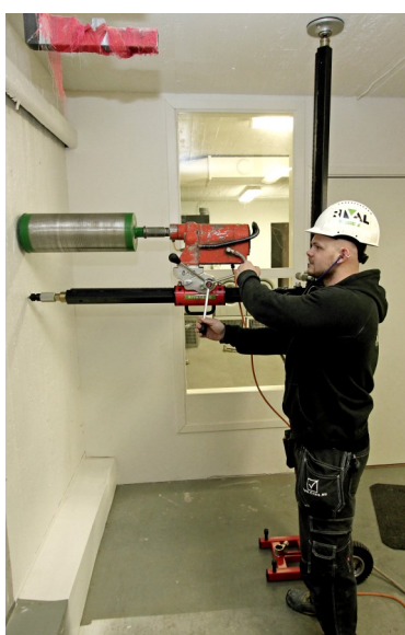
Horizontal drilling using 50 <sup>+</sup> telescopic drill stand and Weka core drill motor.