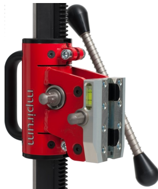
40 + drill carriage with universal motor mounting is both strong and compact.