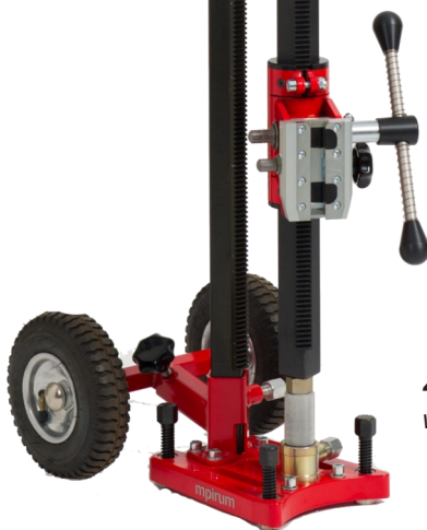
40 + telescopic drill stand with crankable stanchion.