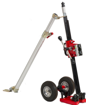
40 + hand held drill stand using FlexSupport + for increased strength.

To the four 40 + och 50 + drill stands with universal motor mounting also have Weka and Ø 60 mm mounting plates as accessories.