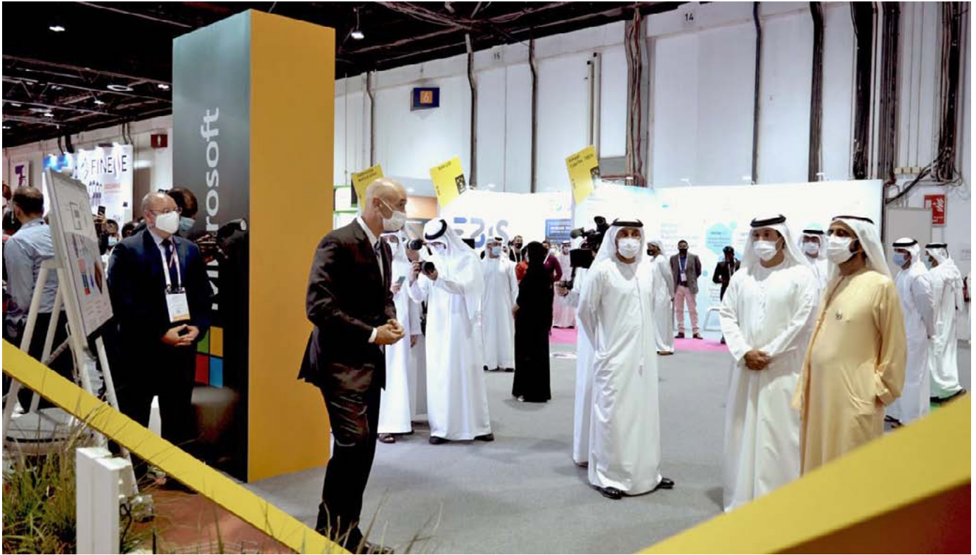
Sheikh Mohammed bin Rashid, Vice President and Prime Minister of the United Arab Emirates, and ruler of the Emirate of Dubai at GITEX2020 finding out about Azure FarmBeats.

used on farms covering over 24 million hectares in the US, Canada, Brazil, Europe and Argentina.