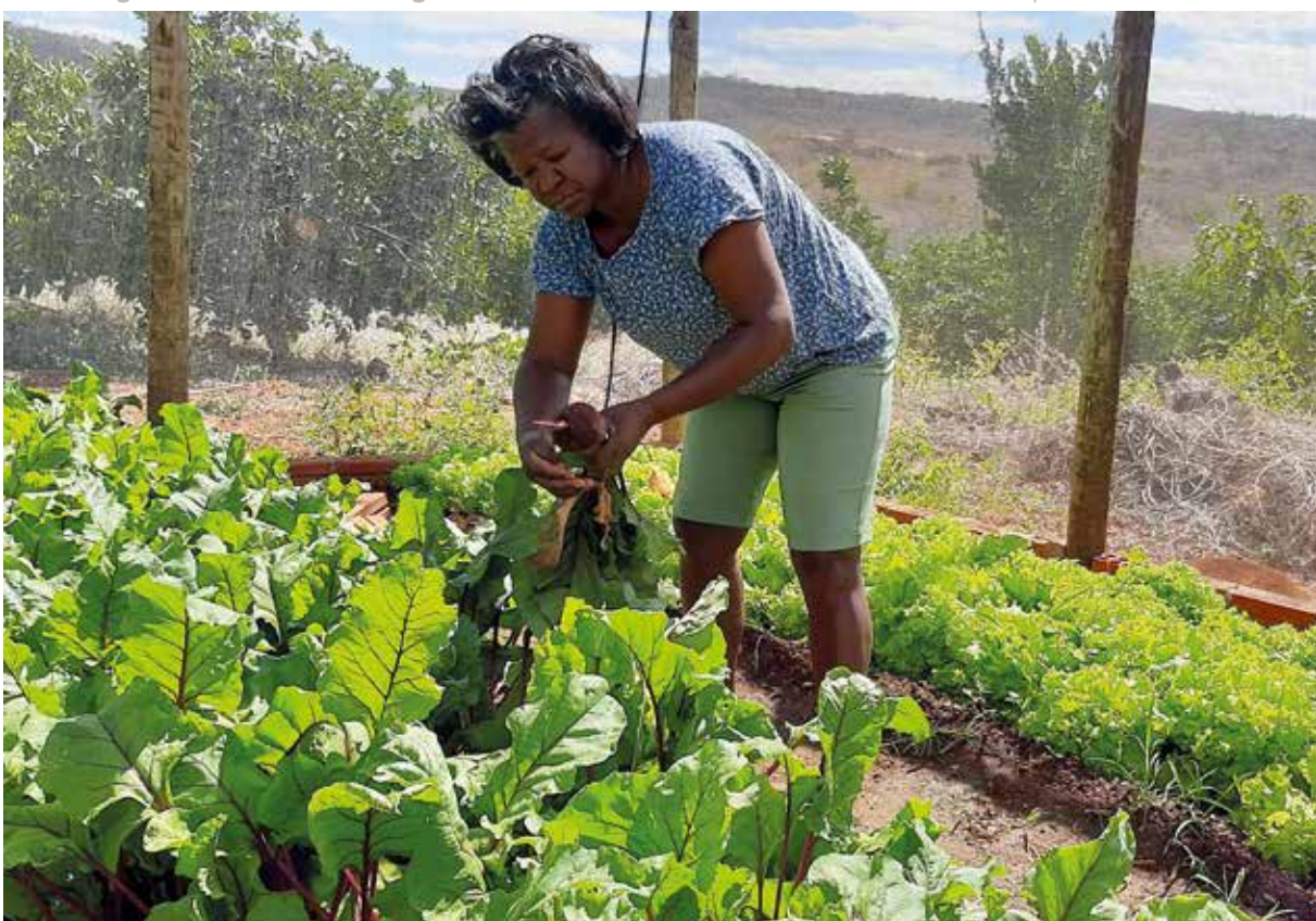
Harvesting beetroot at Fazenda Cigano, Riacho de Santana - Bahia, Brazil.

For example, from their reflections and actions, peasant women realised that a significant part of their production came from the home garden. While home gardens have a historical significance in securing food