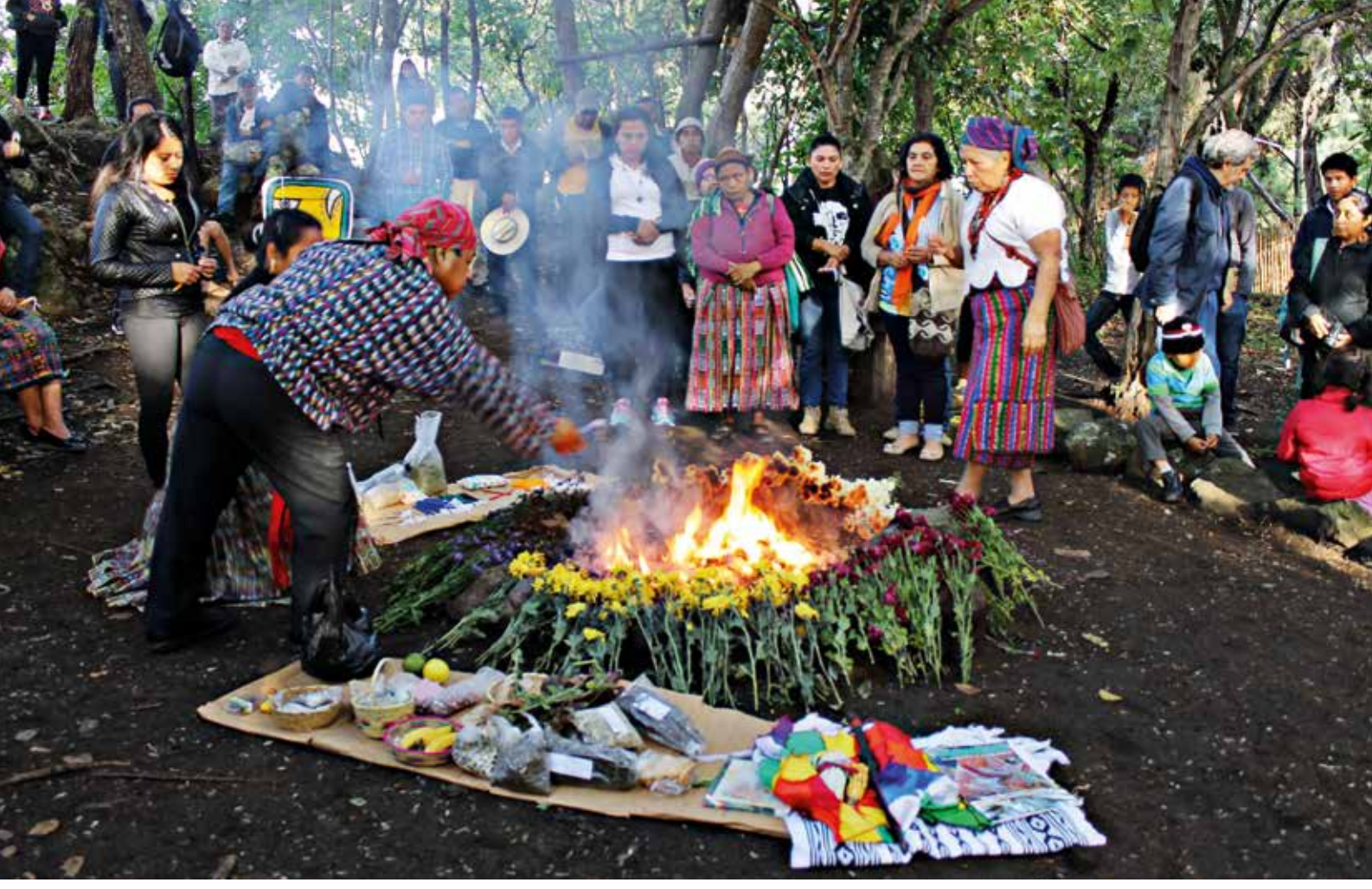
Our identity is our history and our history is our identity.

'Scorched Earth' policy, which consisted of violently removing rural crops, houses and people. Indigenous peoples' and peasants' property documents were erased to pave the way for land appropriation.