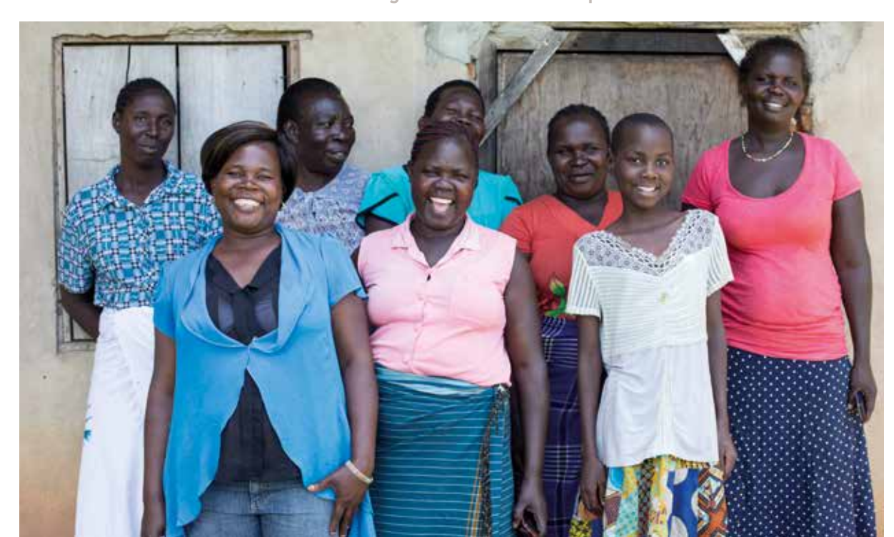
"There is a need for networks that are advancing rural women's leadership."

Agroecology has a female face. The majority of people who till the land and save seeds are women, who have relationships and knowledge that are important for agroecology. Sadly, when you go to an African household you will find that men control the land, cattle and coffee or tea plantations. These are deemed to be 'male' crops, whereas women control crops that do not earn cash for the household but are mainly for subsistence. Ironically, it is the women who harvest the tea and coffee and take it to the millers for processing, but when the cash gets paid, it is the males who control this money. In some cases, when farmers are paid bonuses or when prices of commodities in the