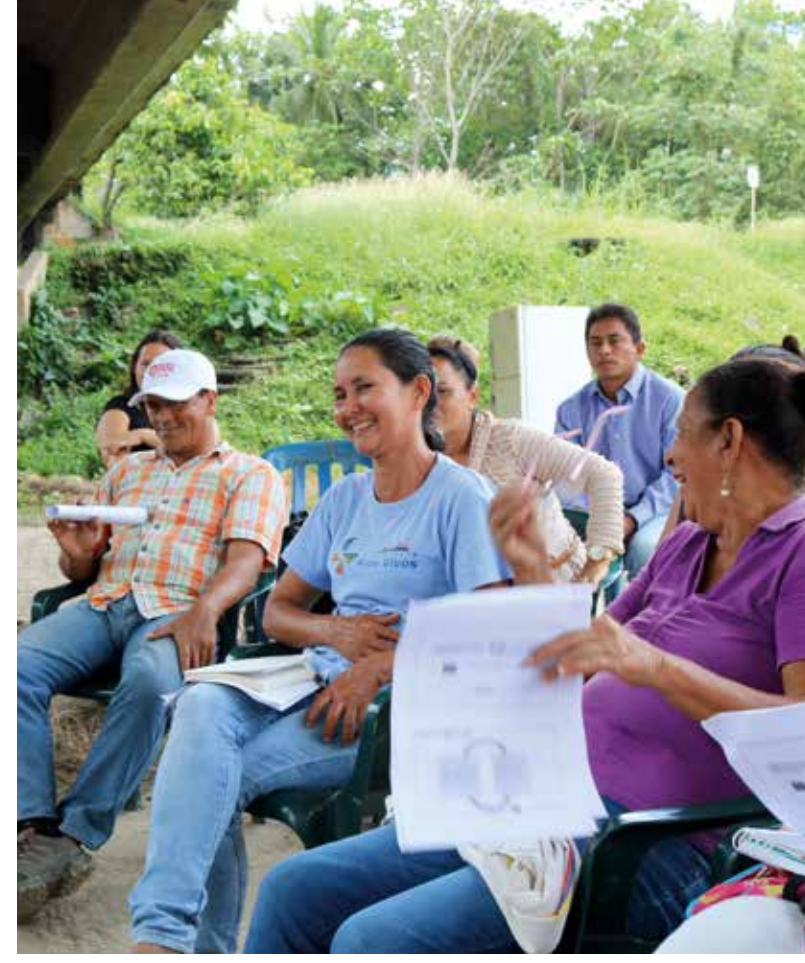
An agroecology gathering of farmers in La Playa, Santander, Colombia.

These developments have shown how agroecological spaces, originally primarily dominated by women,