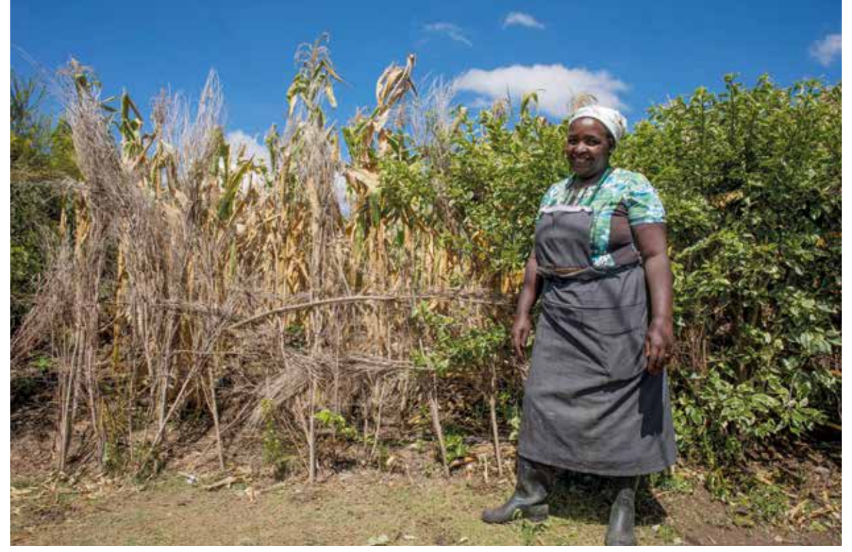
"The majority of people who till the land are women. But who controls the resources?"

market go up, men tend to leave home, go to the nearest town and spend all the money. That is why it is important to start a dialogue about food production and who controls the resources.