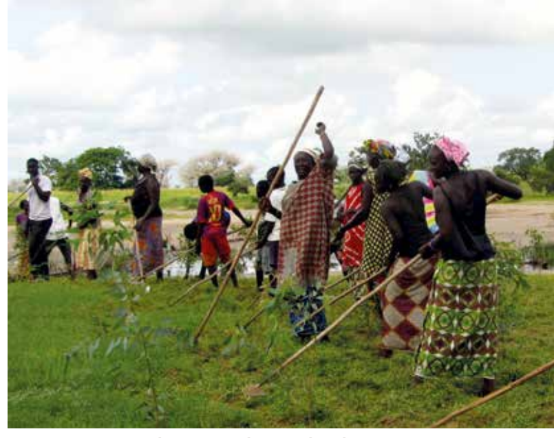
We cannot assume that agroecology is already feminist in itself.

A feminist agroecological transition must go hand in hand with changes in relationships and roles between men and women in their homes, building new forms of coexistence. This, together with the equal distribution of care work, would allow women to occupy some of the spaces that are currently taken up by men.