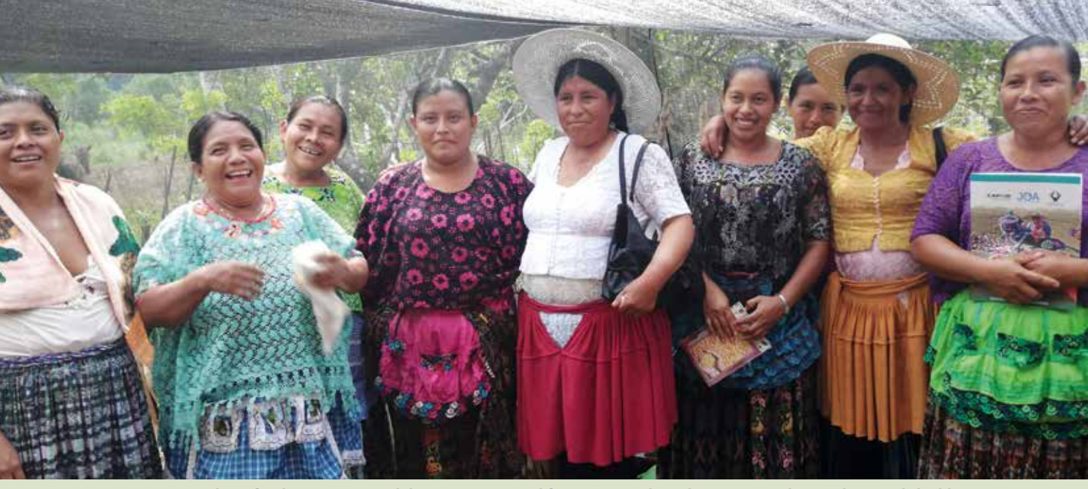
Agroecology, food sovereignty, solidarity economy and feminism are aligned movements that work towards building other ways of being in the world.

bly (p. 21) suggests that the risk of co-optation can be greatly reduced when movements organise not around agroecology as a practice, but around more fundamental demands, including those for women's leadership, horizontal ways of collaborating and for perspectives that emphasise care rather than profit or control.