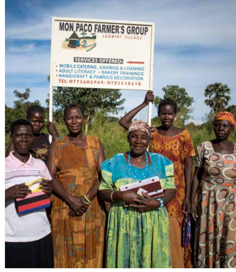
We must make sure that women and their practices are no longer made invisible, ignored or erased from memory.

have learned a lot. Important questions for us are: how can we create different, non-hierarchical organisational forms and ways of leading? Leadership for what? To change what? For us, leadership is a means and not an end in itself. It has to be rooted in the values of the movement and an understanding of the change that we have to make in the lives of women. This implies deconstructing the concept of leadership, especially