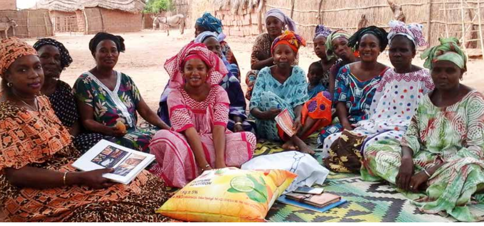
Women's credit groups bolster leadership, solidarity, and self-confidence.

communities have reformed governance at the community and municipality levels, strengthening the position of women in the process, including those from the most vulnerable families.