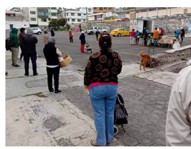
Social distancing at the Carcelen market in the North of Quito.

The Colectivo and MESSE consider the production and exchange of food as fundamental to the identity, health, environment and social well-being of people. Through 'eating well' in every way, we argue,