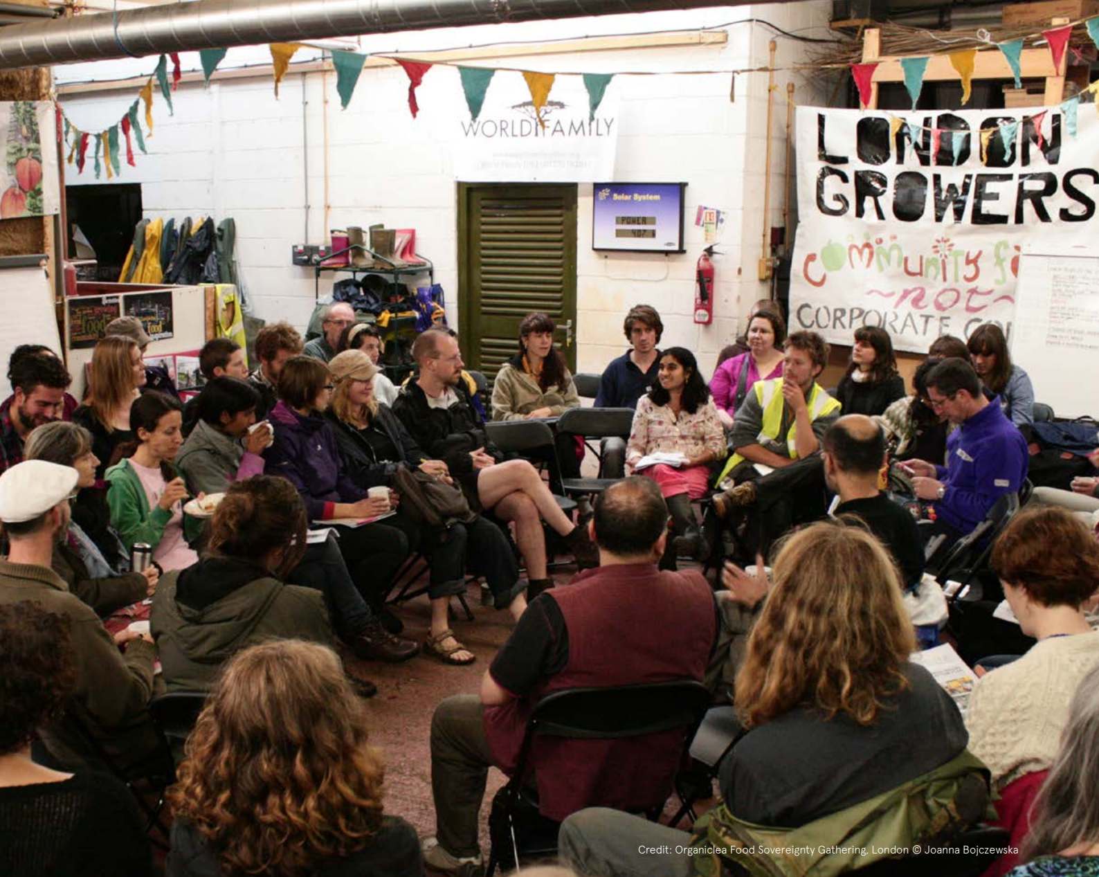
Credit: Organiclea Food Sovereignty Gathering, London © Joanna Bojczewska