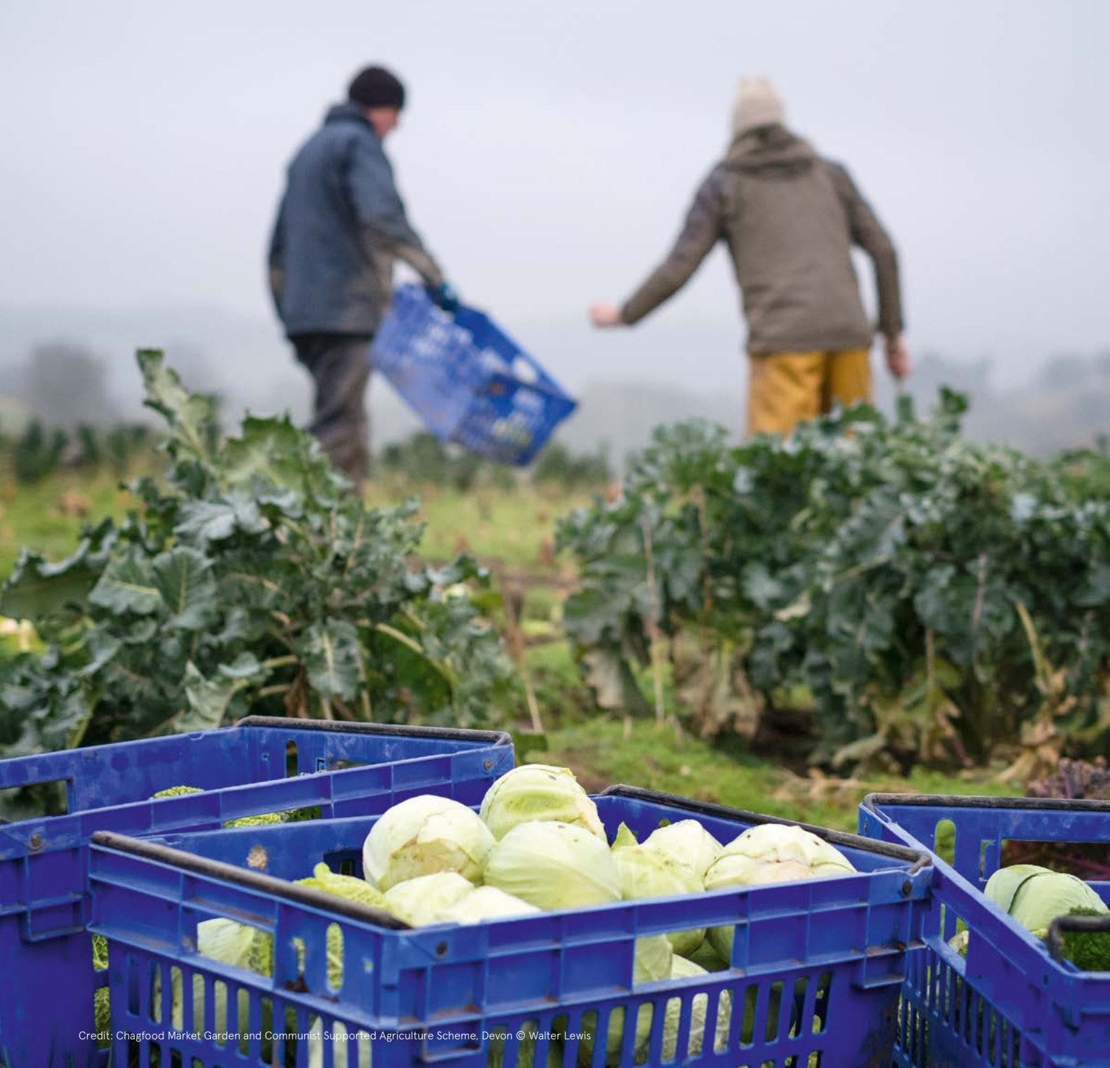
Credit: Chagfood Market Garden and Communist Supported Agriculture Scheme, Devon © Walter Lewis