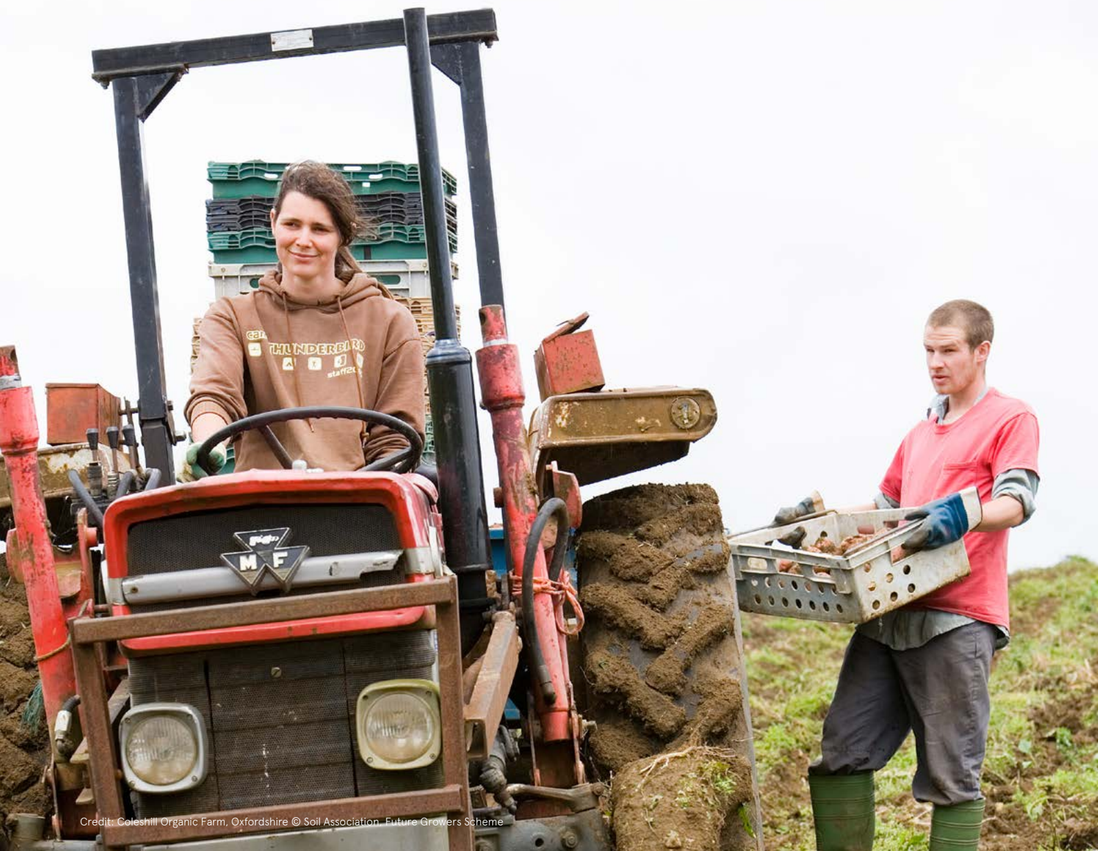
Credit: Coleshill Organic Farm, Oxfordshire © Soil Association Future Growers Scheme