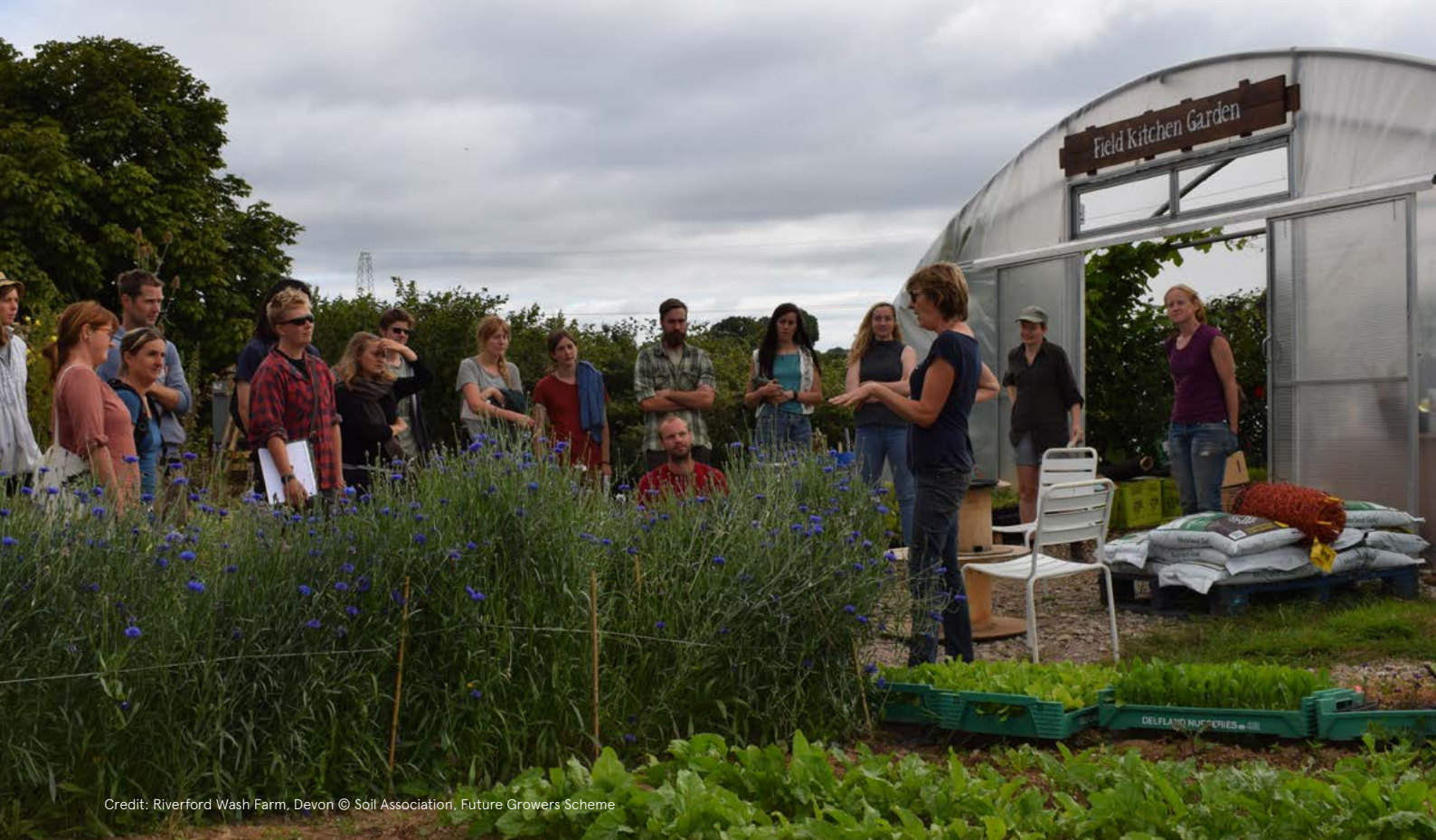
Credit: Riverford Wash Farm, Devon © Soil Association, Future Growers Scheme