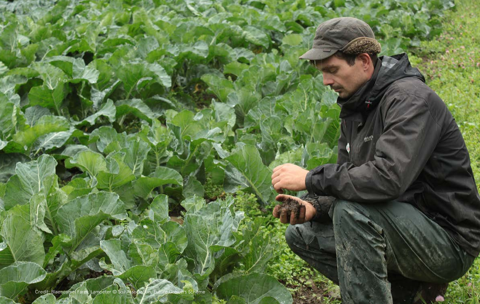
Credit: Blaencamel Farm, Lampeter © Soil Association, Future Growers Scheme

hedgerow were lost between 1947 and 1990; 216 more than half of all orchards in the UK were removed between 1980 and 2005; 217 and over 44 million breeding birds were lost in the last 50 years. 218 Agricultural intensification has been identified as the most important driver of biodiversity change in the UK. 219