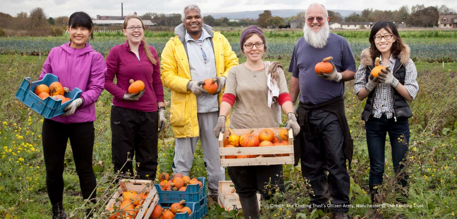
Credit: The Kindling Trust's Citizen Army, Manchester © The Kindling Trust