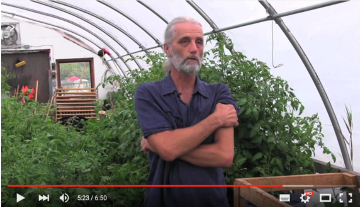
Video 1 – video about the Real Manitoba Food fight – a campaign to contest the industrial orientation of food safety regulations in Manitoba and the lack of support for community food systems. Available at: https://www.youtube.com/watch?v=H1F6sCPMlm8