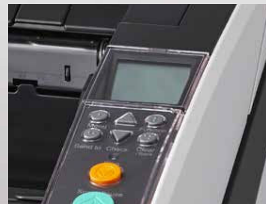
Integrated LCD operating panel

Fujitsu's fi-7800 and fi-7900 deliver the complete scanning solution. A combination of our market-leading scanner, software and service give you everything needed for a more productive system and more productive people, allowing you to focus more on your business and less on your technology.