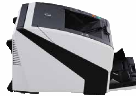
fi-7800 – A4 Landscape at 300 dpi 110 ppm / 220 ipm fi-7900 – A4 Landscape at 300 dpi 140 ppm / 280 ipm Scan mixed batches through the 500 sheet ADF

To prevent breakdowns, fi-7800 & fi7900 scanners have a metal plated paper path meaning no damage from paper friction, unlike resin surfaces. A ball bearing structure balances the load on the shaft, giving the scanner longevity and maximizing productivity.