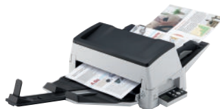
Straight paper path