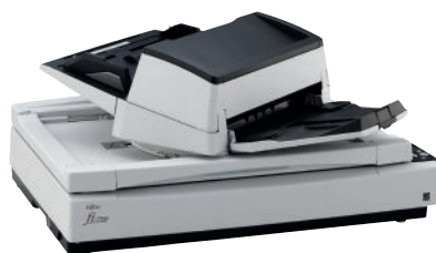
180 degrees movable ADF

Both scanner models feature a unique market proven design concept that adjusts to individual user preferences and requirements. The fi-7700's ADF unit slides to either side or rotates by 180 degrees.