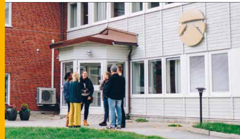
ACADEMIC DEGREES Page 28