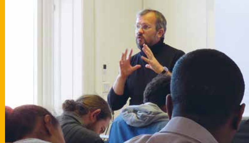
ABOUT SANKT IGNATIUS Page 4