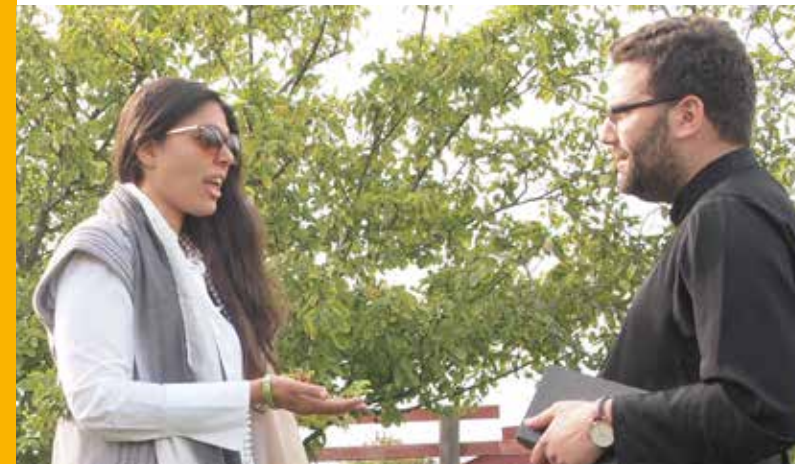
VOCATIONAL PROGRAMS Page 13