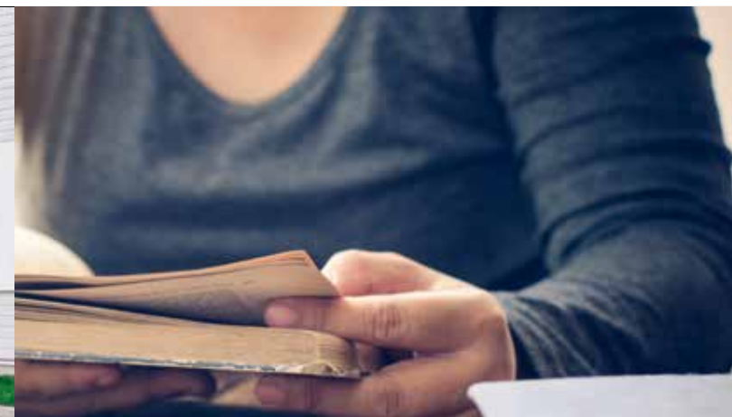
REQUIREMENTS Page 35