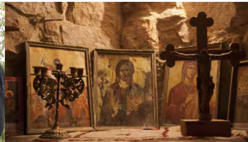
SPECIAL PROGRAMS & COURSES Page 17