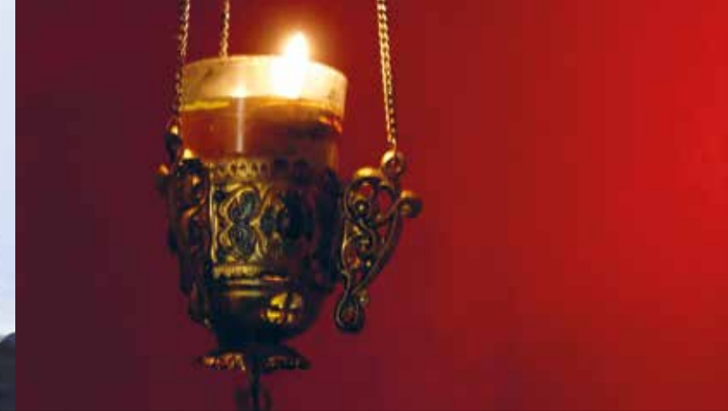
OUR SEMINARIES Page 9