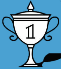
Fun and Competition