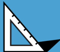
Building and Design