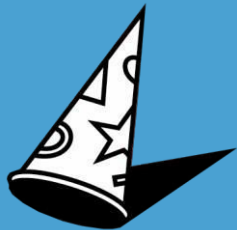
Party & Theme Dinner