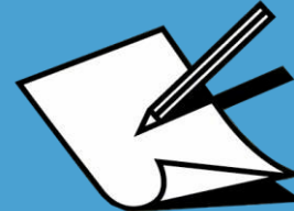
Team work skills and personal development