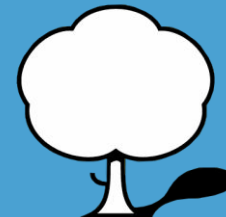
Corporate Social Responsibility