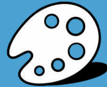
Art and Culture