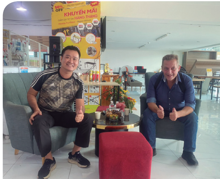
Meeting with Mr Jack, Founder and CEO in Vinahardware's showroom.

to become a leading trade merchant for all kinds of hardware in the domestic market supplying more than 10,000 SKUs including screws, nuts and bolts, bespoke ornamental chrome parts, OEM folding brackets and complex recliner chair brackets to mention a few. Unknown to even some of their hundreds of domestic customers, a significant and growing part of their output is manufactured in-house. In fact, if you import furniture from Vietnam, it is more than likely that some of the metal parts, standard and purpose made, are made at Vinahardware's sophisticated factory.