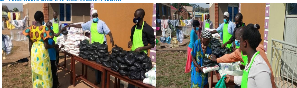
The distribution of items to the selected beneficiaries