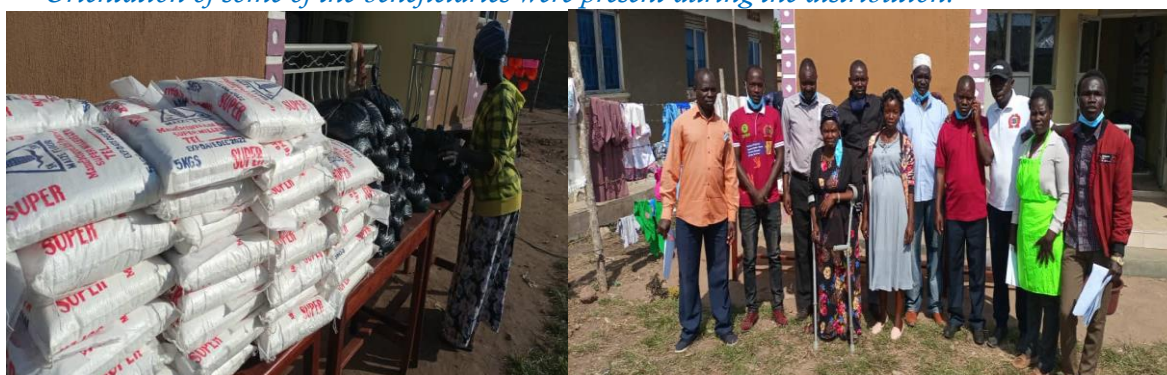
The picture above (left) shows a volunteer arranging the food items for distribution. Next (right) is a group photo of STAD volunteers and the distribution team.