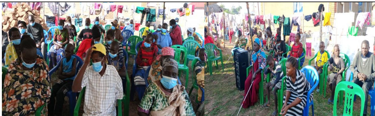
Orientation of some of the beneficiaries were present during the distribution.