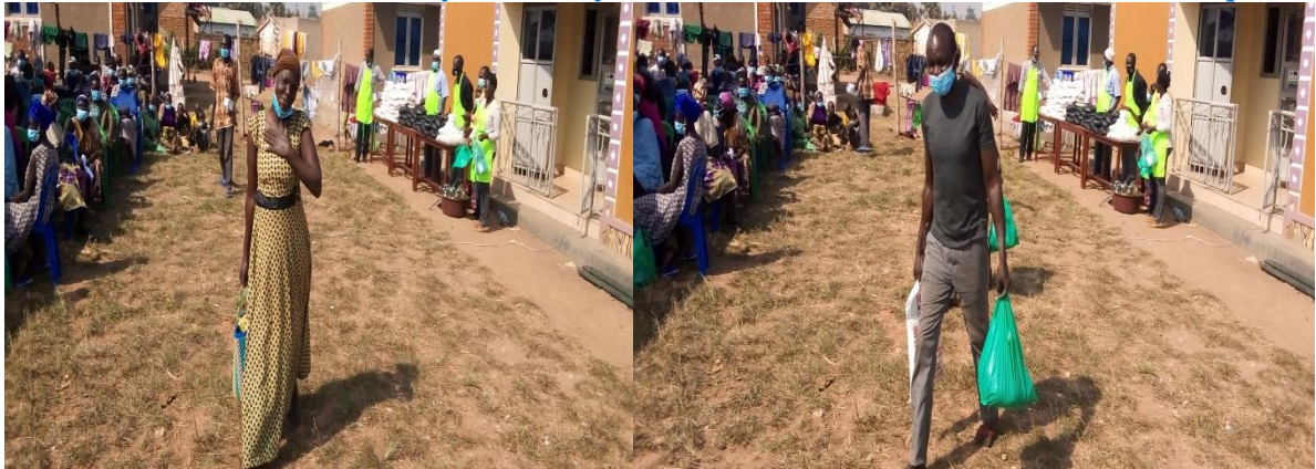
The photos above show an excitement of a widow and a widower while carrying food items