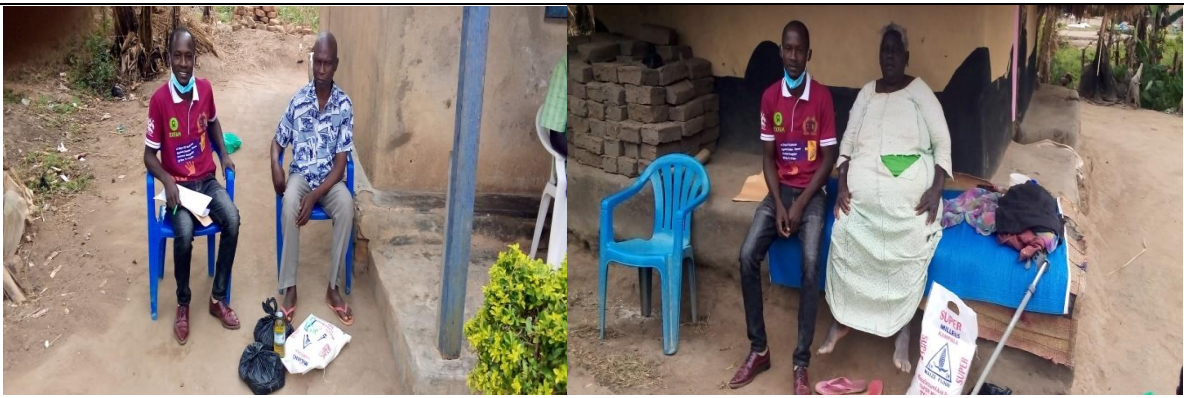
Home o home distribution for the beneficiaries who could not walk to the distribution point.