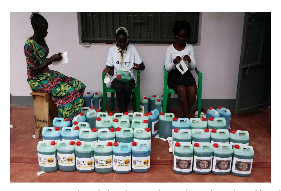
Trainees putting branded stickers on the ready-made packaged liquid soap in 5Litre jerricans

Through this training, the trainees were able to gain relevant skills to produce 350 liters of liquid soap for 70 households. Initially, the target was to produce 250 liters for 50 households but during the mapping process, it was discovered that the number of desperate households was higher than planned and STAD had to step in with additional contribution for the 20 households