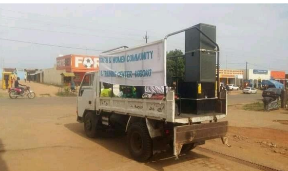
YWCDO/STAD opening the Awareness campaign drive in the sub-counties