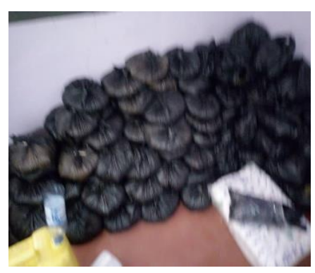
Coordinator YWCDO giving a hand in offloading the purchased items from the truck into YWCDO store