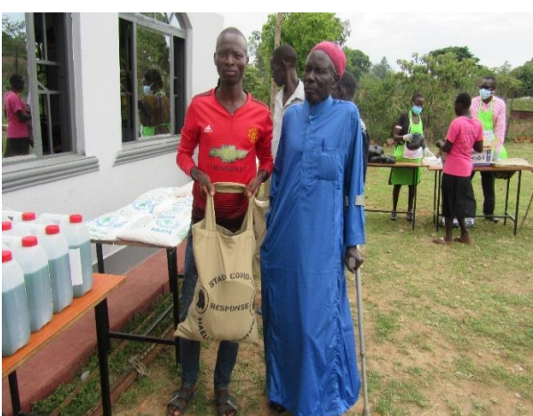
The elderly, women, children and disabled receiving food items