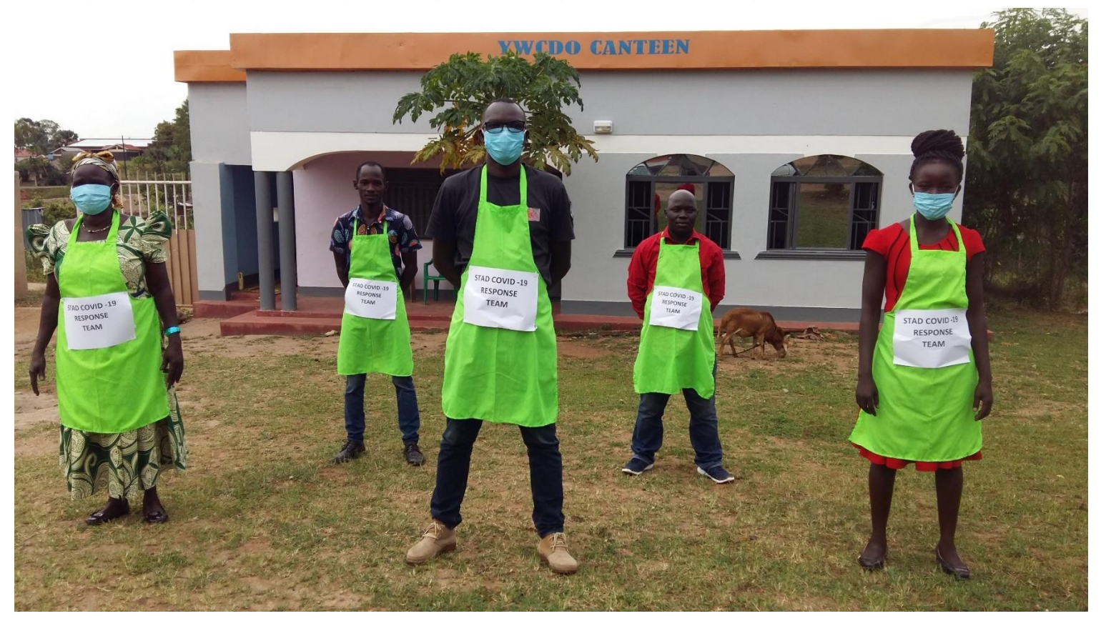
STAD/YWCDO RESPONSE TEAM APRIL 2020