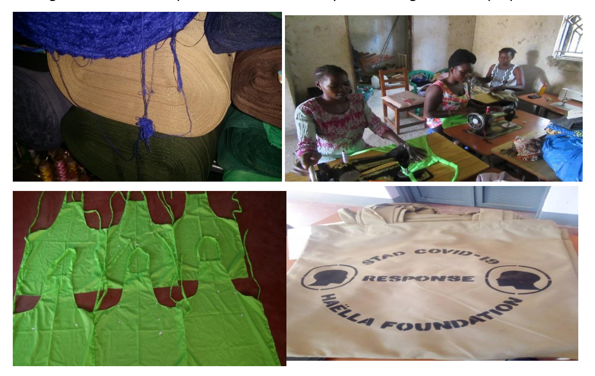
Women in training session for sewing the packing bags and aprons and products made

With the help of YWCDO sewing machines, women were trained on how to cut and sew the bags and Aprons. 50- and 20-meters Cotton materials were purchased and used for making bags & Aprons respectively. A total of 5 women were trained from 18<sup>th</sup> -19<sup>th</sup> April 2020 at YWCDO premises. A total of 70 packaging bags and 6 aprons for the response teams were made. The bags were used for packing the food items and were labeled with COVID-19 brand as a way of creating awareness on the pandemic whenever they use the bags for other purposes.