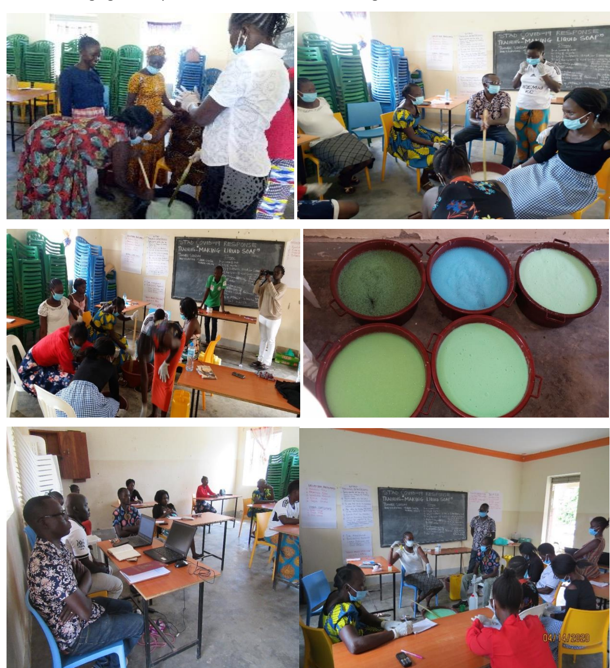
Staff and volunteers in the training sessions & raw liquid soap materials

A four-day training session on making liquid soap was held from 14<sup>th</sup> April 2020 to 17<sup>th</sup> April 2020. A trainer was hired to conduct the training program. The trainees include staff of STAD and YWCDO and other volunteers. A total of 9 women and 4 men were trained. During the training, the Program Manager –STAD in his speech guided the trainees that the training should be able to equip the trainees with skills for making liguid soap for use in future to earn a living and become self-reliant'.