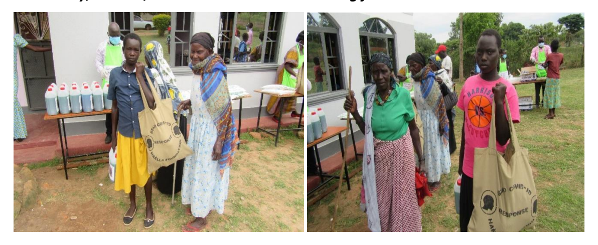
The elderly above 70 years of age being supported by their grandchildren in carrying the food items