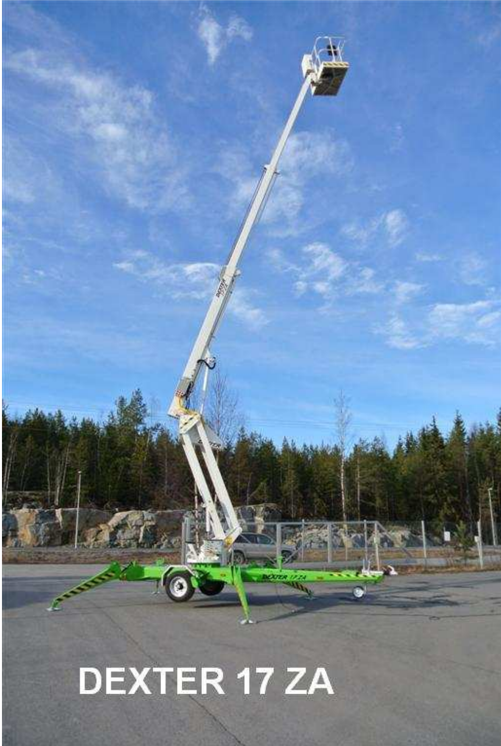
DEXTER 17 ZA