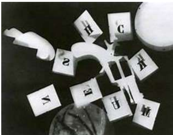
Abstract Composition, 1924

Man Ray was an American visual artist. Interestingly he considered himself a painter but was best known for his photography. He worked a lot with photograms, which he called 'Rayographs' in reference to himself.