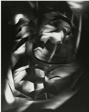
Light Abstraction, 1925

Bruguiere was an American photographer. He consciously made non-objective photographs as early as 1912. Throughout his life, he experimented with multiple-exposure, solarization, original processes, abstracts and photograms.