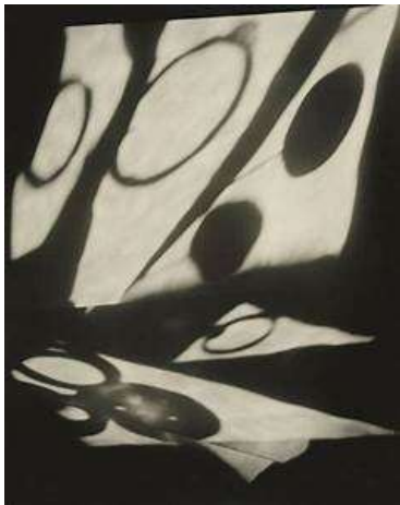
Abstract Photo, 1928-29

He was recognized for his play of “photographic games” with mirrors, lights, and insignificant objects, such as plates, bottles, or glasses, to create unique works. His still life's created abstract forms and played with shadows looking similar to photograms. He also slightly blurred his images to detach from the experience of ordinary reality.