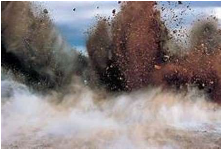
A BIRD/Blast #130, 2006

Hatakeyama is a Japanese photographer. His abstract images are created by blowing things up! (Ori Gersht stylee)