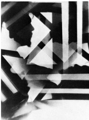
vortograph of Ezra Pound, 1917

Coburn was an American-born British photographer. In his "Vortographs" of 1917, he achieved what are considered to be the first deliberate photographic abstractions, and a deliberate attempt to prove that photographers could fracture space into abstract compositions as Cubist painters and sculptors had done. He built a machine which contained mirrors which he fixed on to the front of his camera.