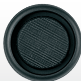
Big surface on/off button