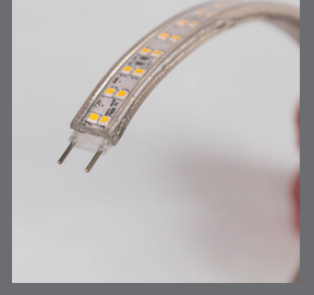
Press it in