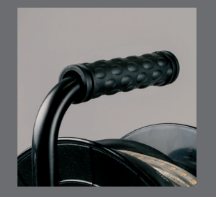
Firm grip handle