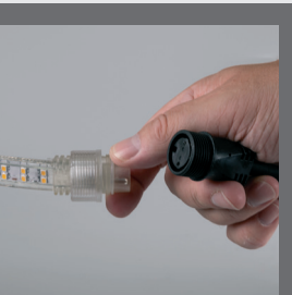
ATTACH / DETACHED 230 V cable from The See Snake