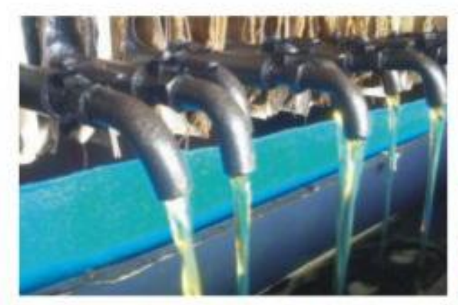
Liuzhou Petroleum Refining Plant

The 4th generation oil purification and regeneration equipment FASON DTS multifunctional Waste Oil Purification & Regeneration Equipment is an upgraded product from our ZTS series equipment.