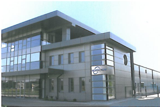
Our company headquarters. The Baltic States are situated in the centre of Europe.

Contact us for state-of-the-art, high quality and environmentally friendly Mould Release Agents.