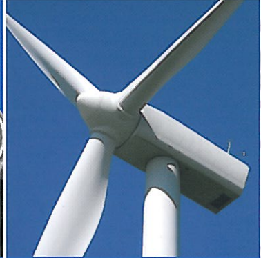
FRP and Composites