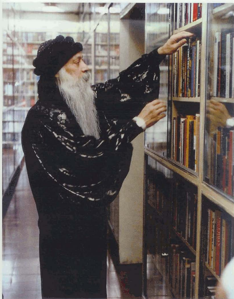
Plate 3: Osho in Osho Lao Tzu library, Pwna