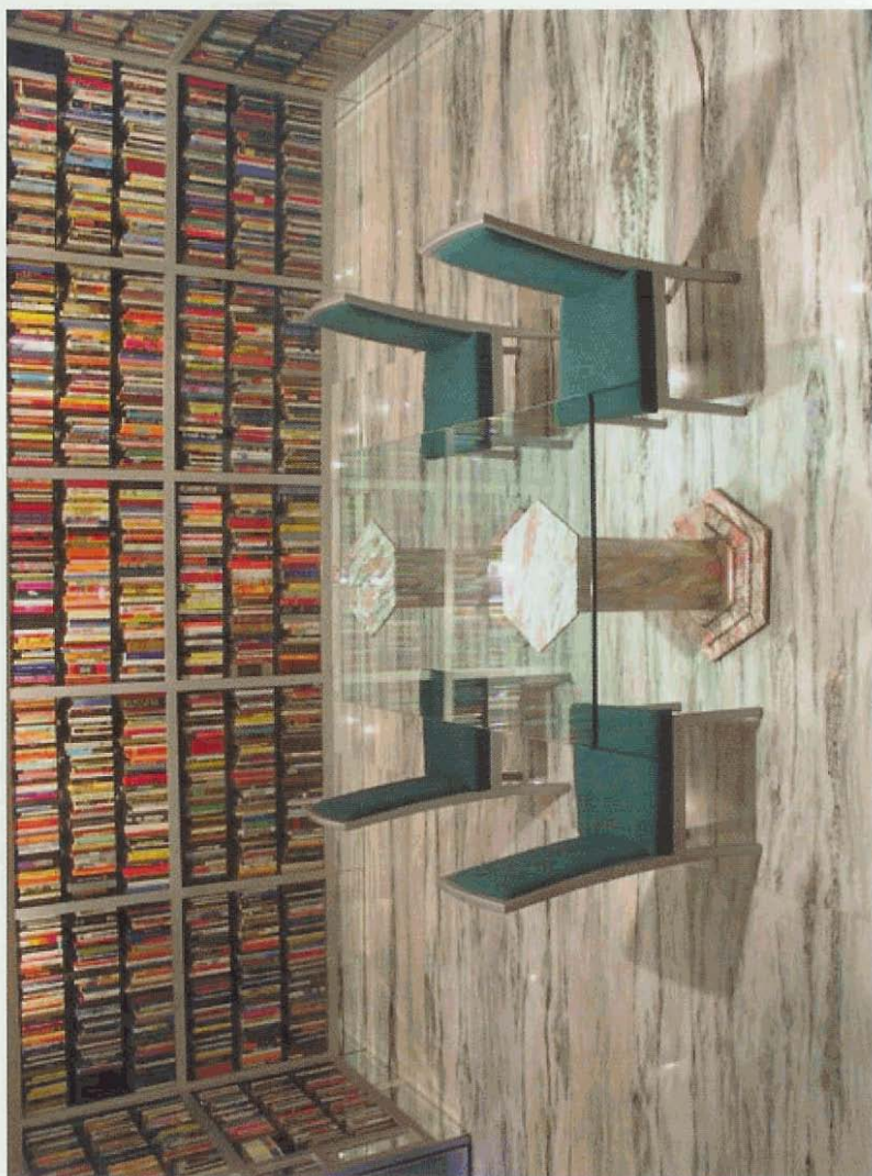
Plate 4: Interior of the central room, Ramakrishna, at Osho Lao Tzu library