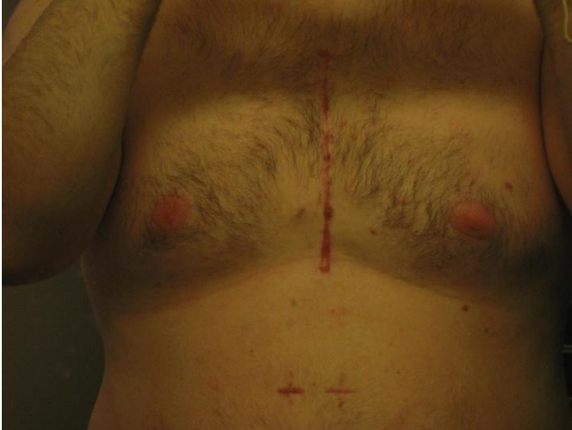
This picture was taken about. 2 ½ months after surgery