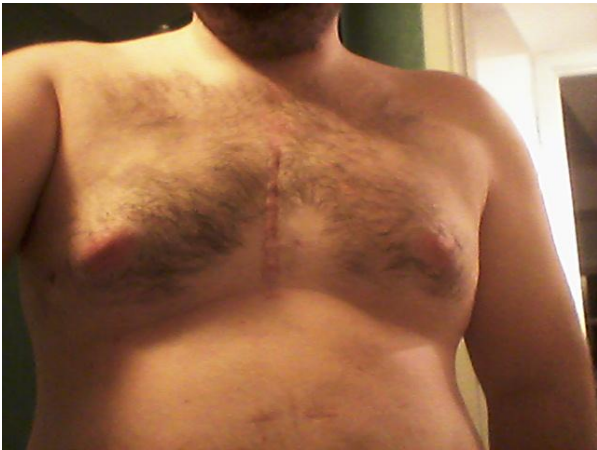
This picture was taken at 31-12-2013 ... about 1 year after surgery

And it goes well and forward Can handle more now than before