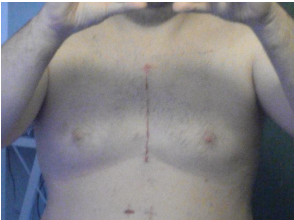
This picture was taken about. one month after surgery