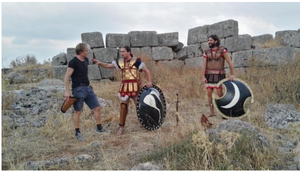
(Me to the left).

2.00 pm: Plataea where we visit the ruins of Plataea. Plataean heroic history. We see the battlefield where the Greeks defeated the Persians in 479 BC, nine years before Socrates was born, as the last battle before democracy and the cultural development accelerated. To modern Plataea for refreshments. We participate in an ancient camp/warriors at Plataea, telling about technique, the battle and leadership. Ancient cuisine. We listen to warrior saying “Oath at Plataea” as before the battle at Plataea.