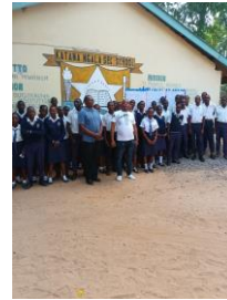
Katana Ngalla Sec. school