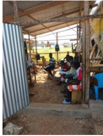
Roka Vocational Centre