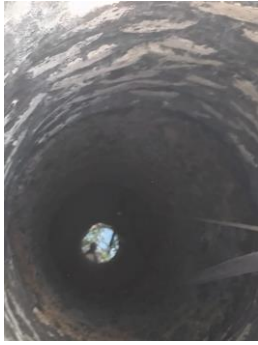
Waterwell Roka Vocational Centre