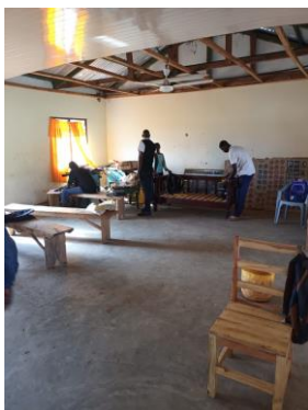
Roka Vocational Centre