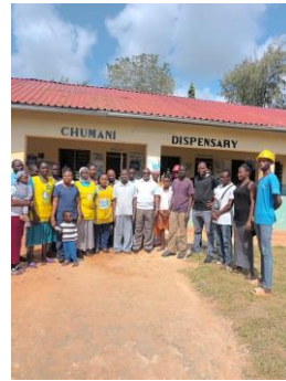
Chumani medical post