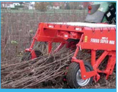
FOBRO Super Max Bed grubber (35-40cm)