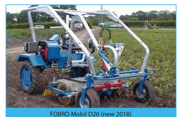
(New with camera control and GPS extendable)