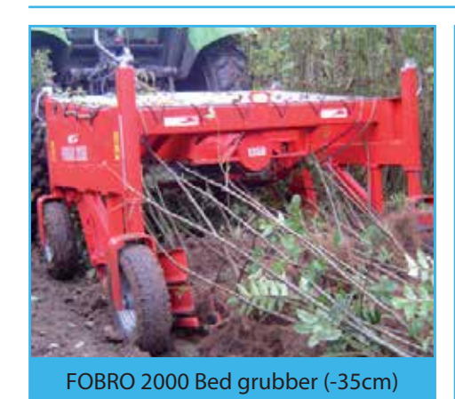
Grubber for bare roots