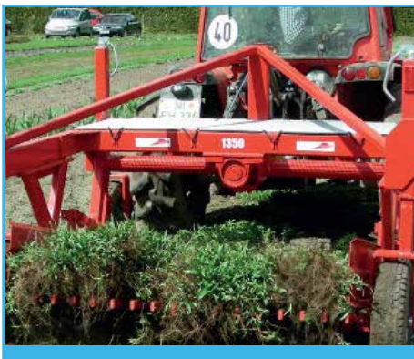
FOBRO Start Bed grubber (-25cm)