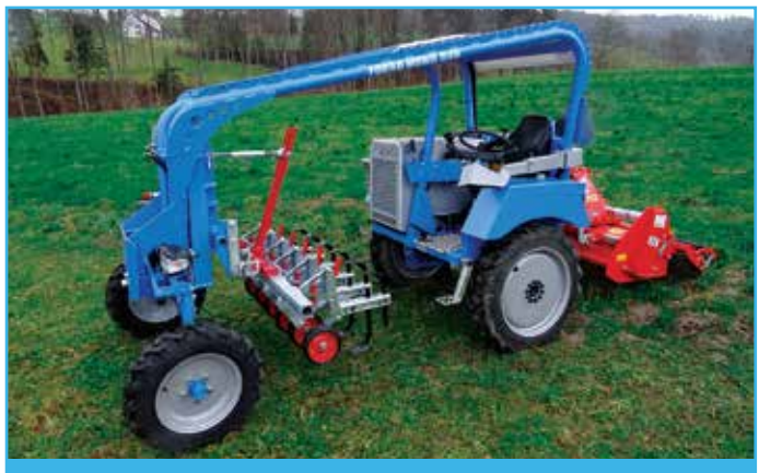
D49 new with bed planner + 25HP- power drive