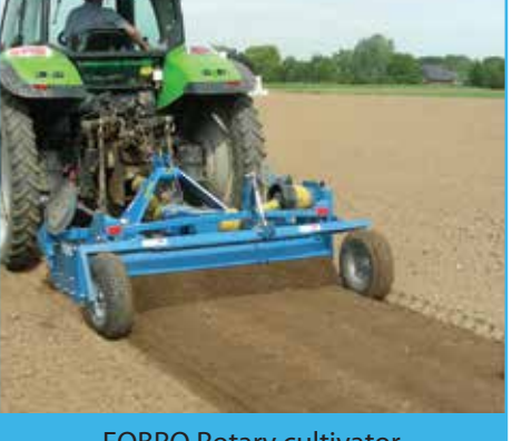
FOBRO Rotary cultivator