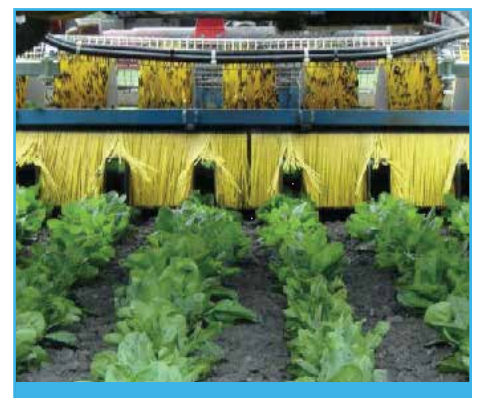
FOBRO Chopping brush