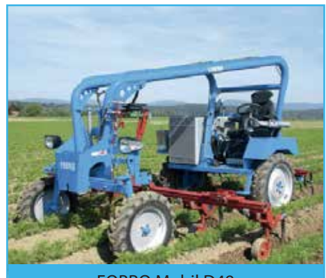
FOBRO Mobil D49