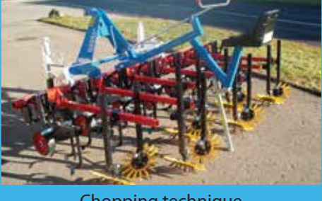
Chopping technique in the modular system