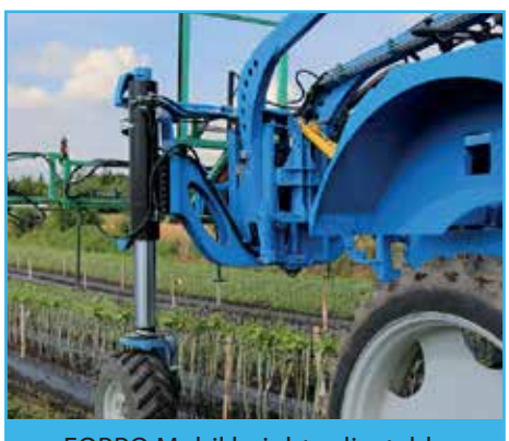
FOBRO Mobil height-adjustable