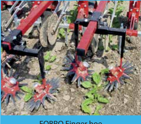
FOBRO Finger hoe