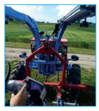
Over 15 possible attachments adapted to your culture available.

Sturdy light-weight tractors with secure overhead frame.