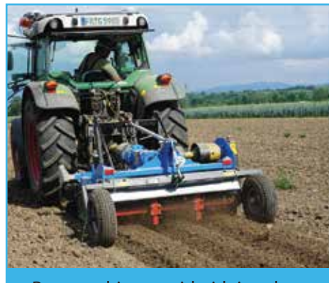
Rotary cultivator with ridging shoe