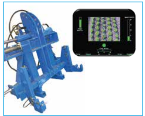
Shift frame + camera