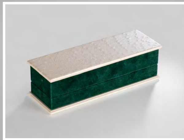
LUXURY OSTRICH SKIN CASE - INDIVIDUAL