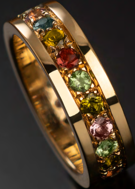
24K INFINITY RING WITH PRECIOUS STONES