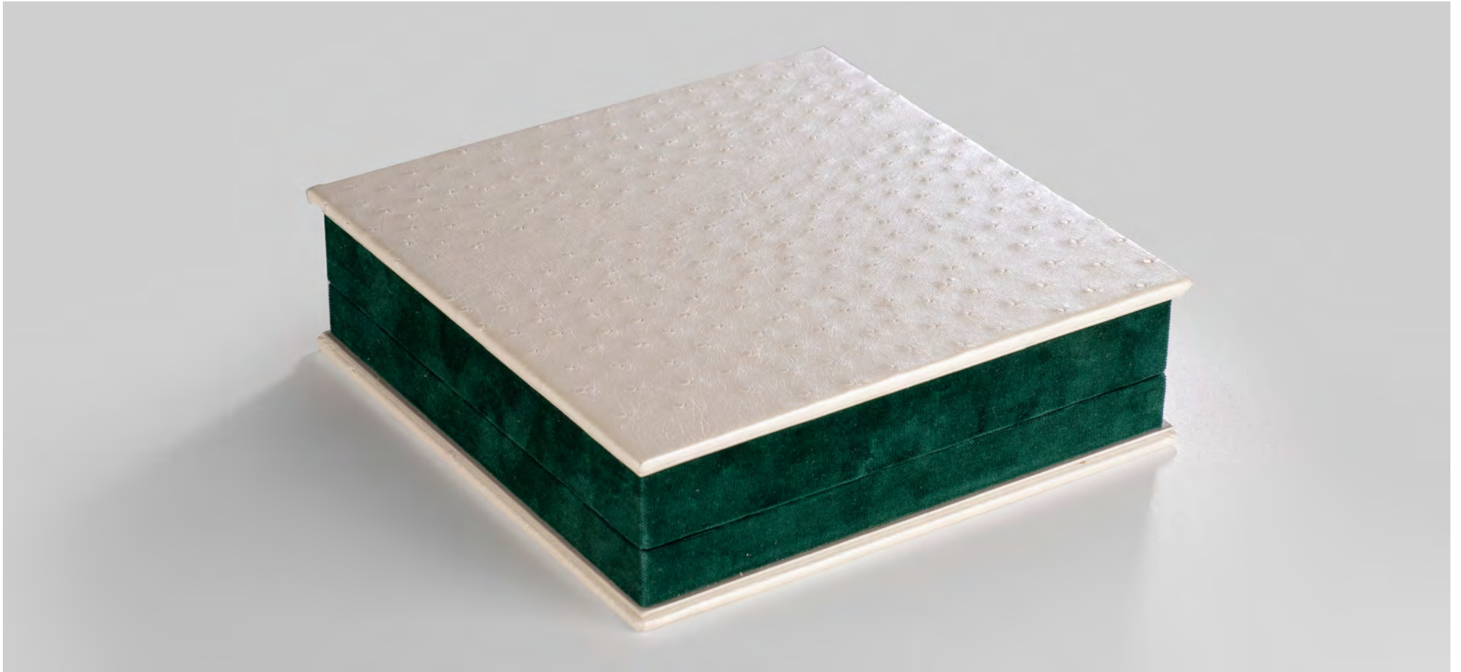
LUXURY OSTRICH SKIN CASE - SET OF 3

An Oska Murano case has an ostrich leather finish cover along with velvet sides. On the inside, the same velvet cushioning is used with an inner silk covered case lid made by skilled artisans. All of our cases are made to measure.