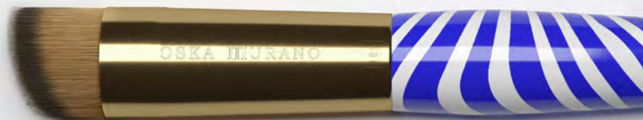
ANGLED STIPLING - LARGE (REF L23-31809)