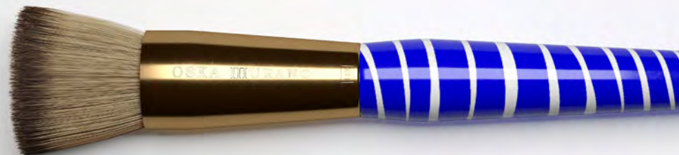
STIPPLING/FOUNDATION - LARGE (REF L22-31927)