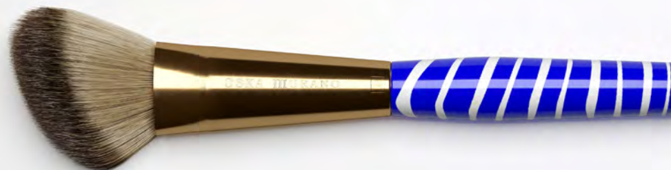
CONTOUR - MEDIUM (REF M23-31925)