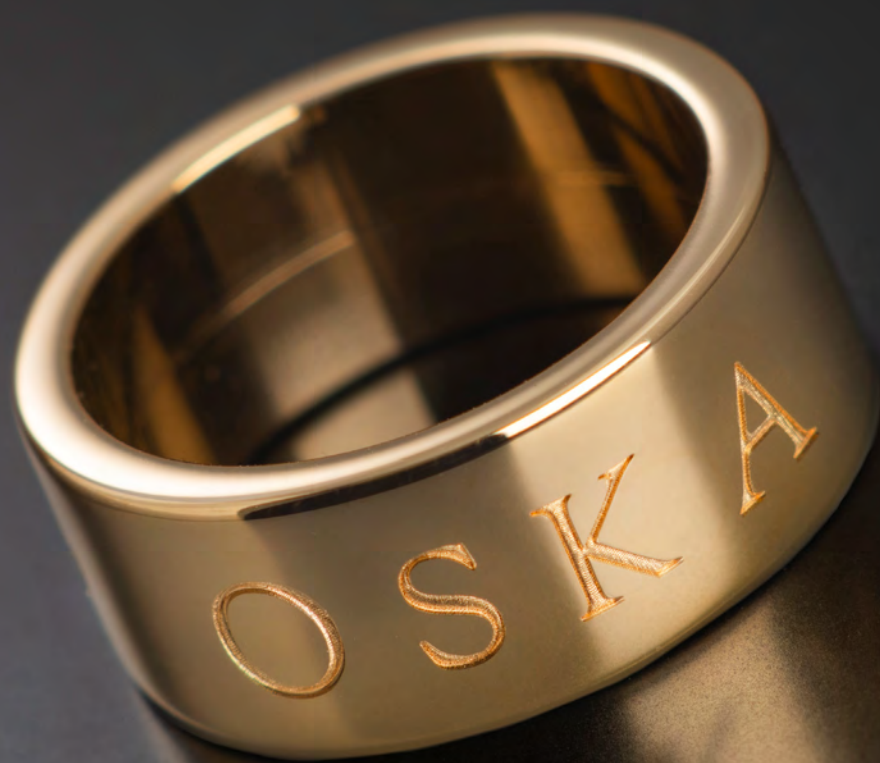
FLAT RING WITH OSKA MURANO ENGRAVED