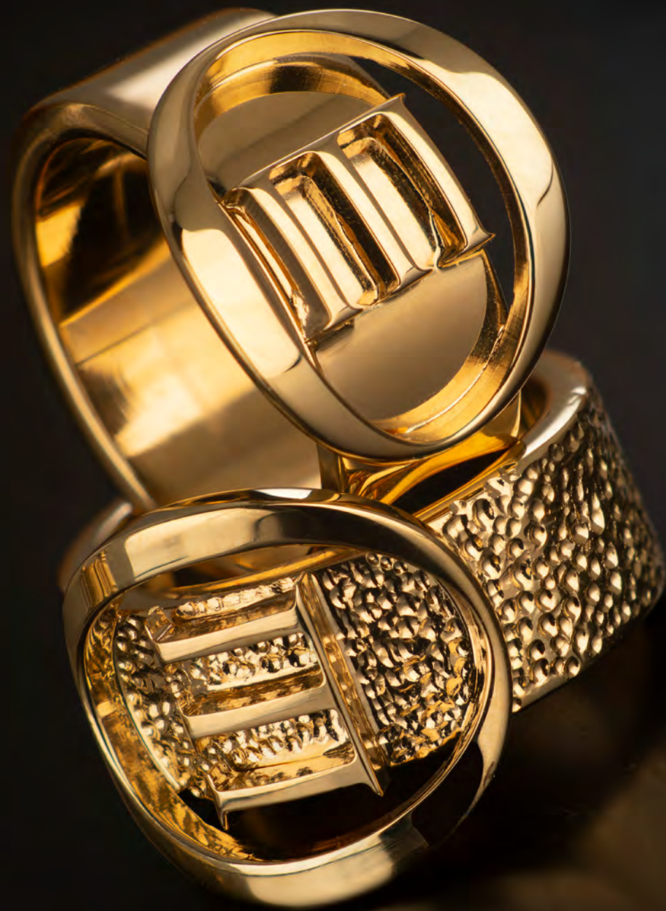
M IN O RINGS (LISCIA & MARTELLATA)