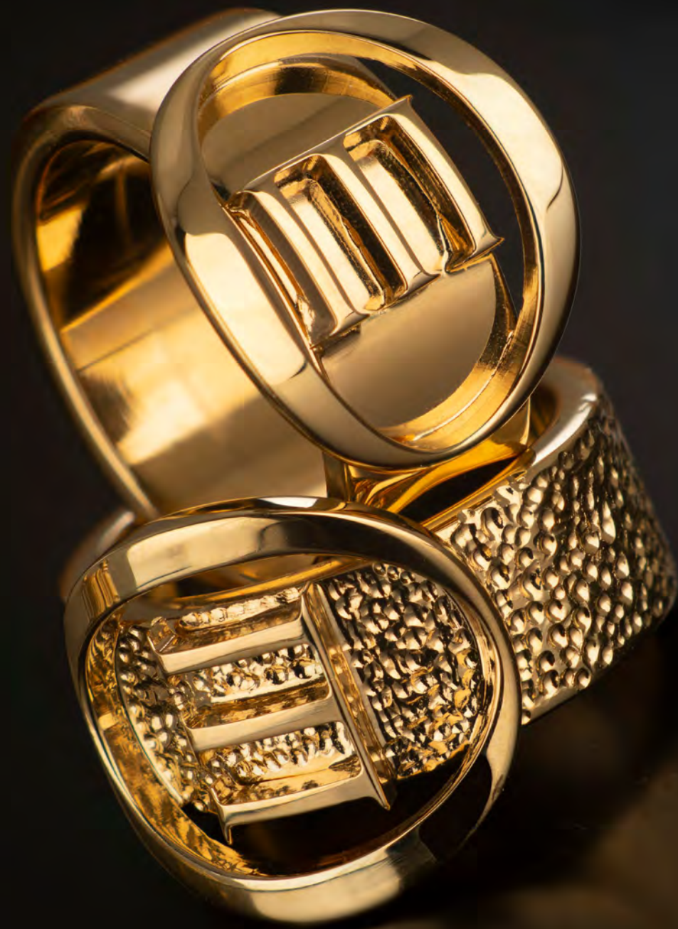
M IN O RINGS (LISCIA & MARTELLATA)