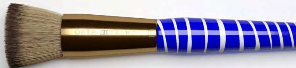
STIPPLING/FOUNDATION - LARGE (REF L22-31927)