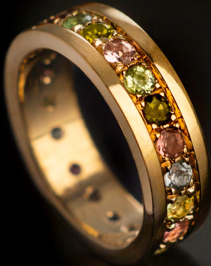
RING WITH PRECIOUS AND SEMI-PRECIOUS STONES