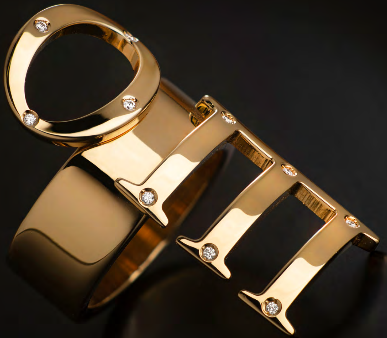
OSKA MURANO RING WITH 10 ZIRCONS