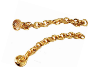
Extrusion Eyelet, round base