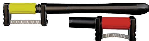
Sunset Strip™ för interproximal reduktion

Vi har ett heltäckande sortiment av tillbehör för alla typer av alignerbehandlingar