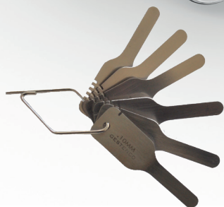
Mark VI™ mätnycklar