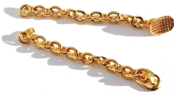
Extrusion Eyelet, ovoid base