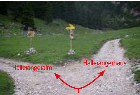
Picture 7: KM 4,35 Turn left to the inn Gasthof Halleranger Alm and turn right to the Halleranger house.