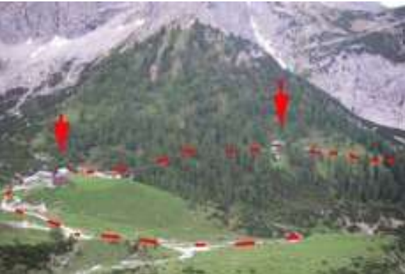
Picture 10: Both huts are connected by a path and are not far apart, which means on your day of rest you can go and check out the neighbouring lodge.