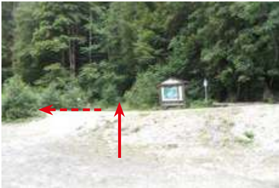
Picture 9: KM 4,90 The Kälbersteig-trail starts at this signpost. Turn right into the forest. Alternatively turn left and continue along the forest road to the Schachen (then continue at Picture 17).