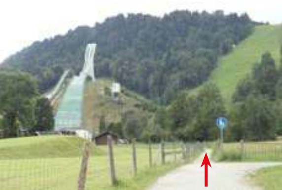
Picture 1: KM 0,00 Walk past the ski stadium (on your left) and follow the road towards the Partnachklamm-ravine.