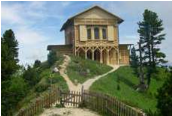
Picture 21: KM 11,90 This is King Louis' Alpine palace on the Schachen. Situated only 100 m next to the Schachenhaus!