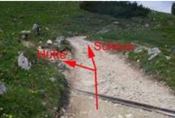
Picture 19: KM 11,55 After the hut of the supply-cable car you can either turn left and walk directly to the lodge or continue straight ahead to the palace and continue from there to the lodge.