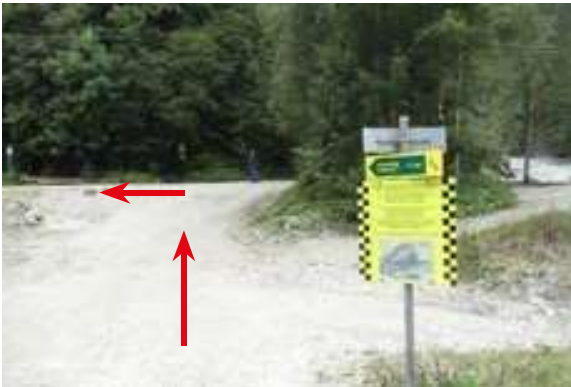
Picture 8: KM 4,85 Walk across the riverbed and turn left towards the next signpost.