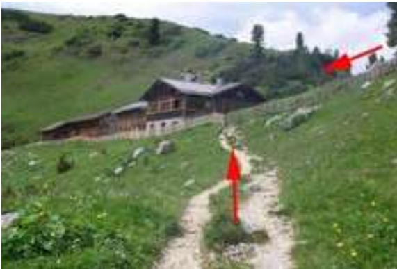
Picture 20: KM 11,80 Schachenhaus. Enjoy your overnight stay on the mountain.