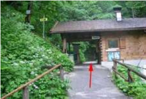
Picture 5: KM 3,55 The adventurous ravine starts at the ticket office. With your guest-card you will get a reduction on the entrance fee.