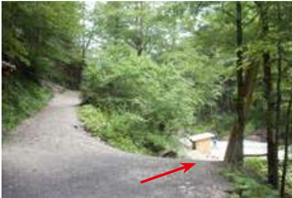
Picture 6: KM 4,60 Turn right here after the ravine and continue downhill towards the river and then continue keeping left.