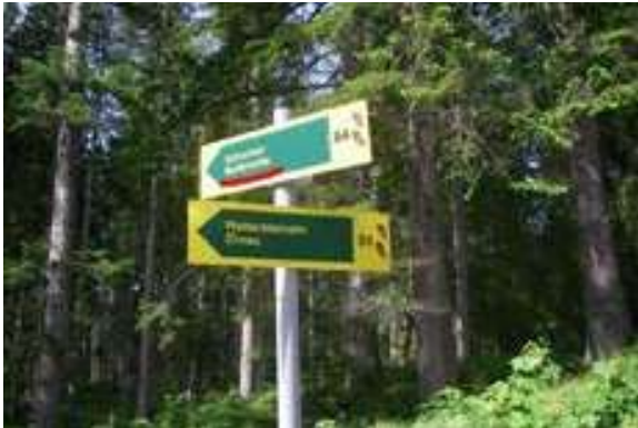
Picture 12: KM 6,80 Always follow the signposting and ascend along the main path, ignore all turn-offs.