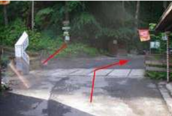
Picture 4: KM 3,50 Turn right here after the restaurants for the entrance to the ravine.