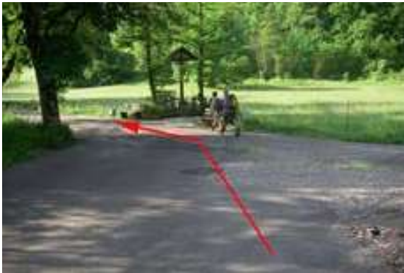
Picture 3: KM 2,60 Turn left at the wayside cross and info board. Now always continue straight ahead until you reach the ravine.