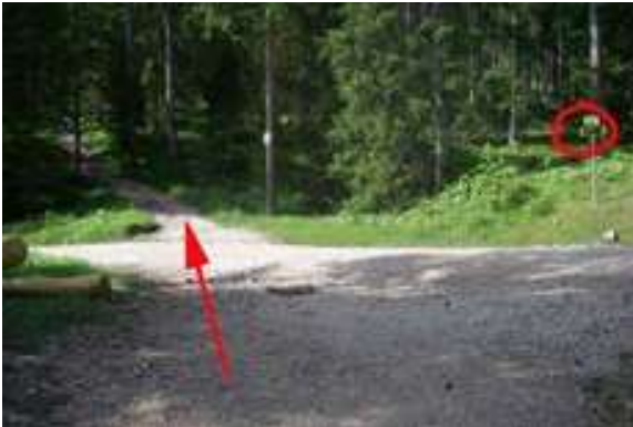
Picture 11: KM 6,80 After the initial steep ascent, a short flat interval follows. Cross the forest road and continue straight ahead.