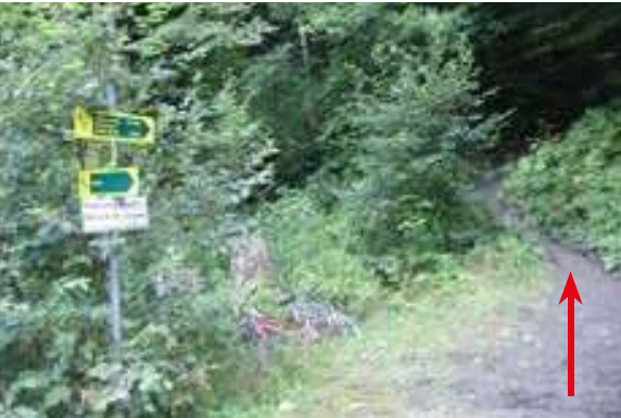
Picture 10: KM 4,90 Now you ascend steeply on the Kälbersteig-trail. From here now always follow the trail and the markings.