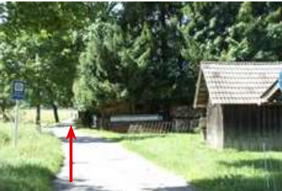
Picture 1: KM 0,00 The walking path starts directly at the bus stop 'Hammersbacher Fußweg' and continues through the meadows. Follow it always straight ahead until Hammersbach.