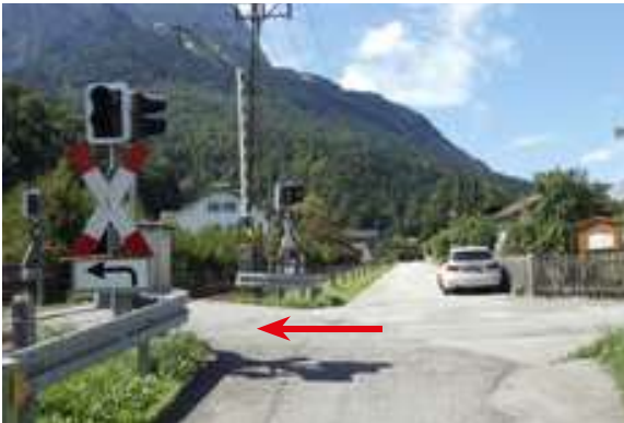
Picture 2: KM 1,40 Walk across the railway tracks in Hammersbach and follow the road straight ahead into the centre.