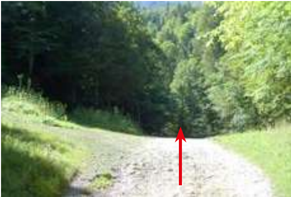
Picture 5: KM 1,95 Keep walking straight ahead to the ravine, soon you walk uphill!