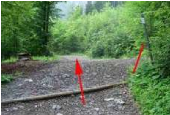
Picture 6: KM 3,00 After the first ascent please continue straight ahead here.