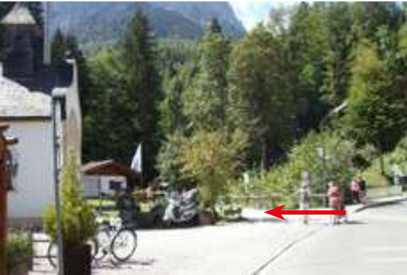
Picture 4: KM 1,80 Turn left at the chapel before the bridge and follow the signposting to the Höllental-ravine.