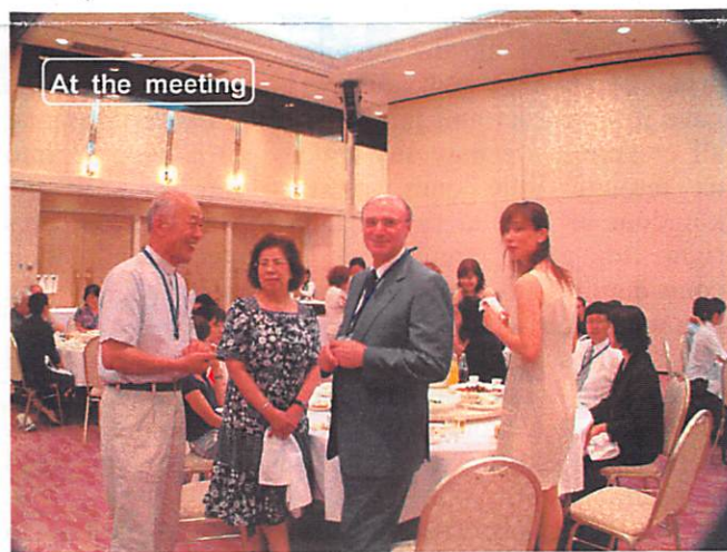
At the meeting

The theme of this year is PEACE TO BE SOUGHT WITH CHILDREN, that is my strong urge to be heard by the millieau, who seems inclined to have their works be successful on social business base and not in the authentic peace construction of mankind. This is a revelation of the last century , i.e. the century of the child; we must not be our eye closed at this new cosmic sean of of our human society.