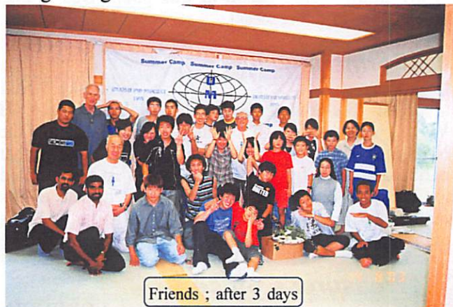
Friends ; after 3 days

meaningful and fruitful time of sharing, prayer, Mass along with games and recreation.