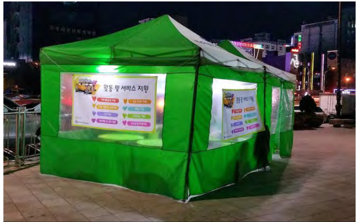
Under the shelter of this tent, AGIT volunteers offer food, clothing and counseling to Seoul's homeless teenagers.