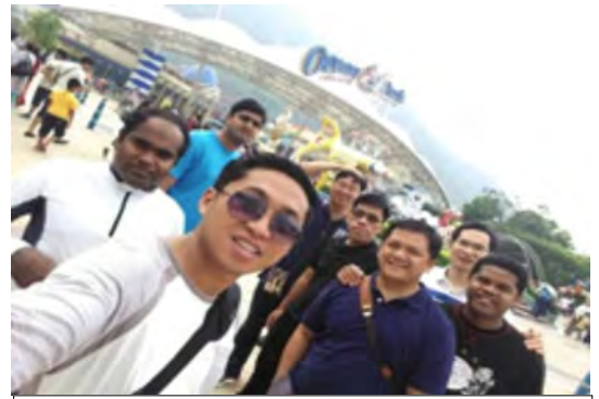
No Hong Kong "mafia"