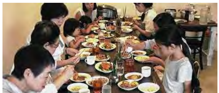
Feeding Underfed Children (kodomo shokudo). Volunteers provide food for underfed children.

Japan Times run a series on “child poverty” in Japan early this year in response to the findings of UNICEF which ranked Japan as only No. 34 among the 41 member nations of OECD in terms of child benefits. (OECD stands for Organization for Economic Cooperation and Development. It started as a group of 18 developed nations coming together