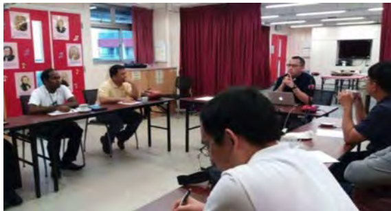
Some serious discussion