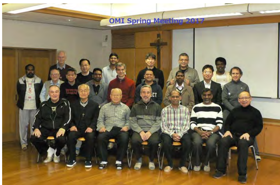
SPRING MEETING 2017