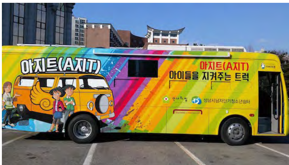
This bus is part of the AGIT program's effort to help Seoul's homeless youth.