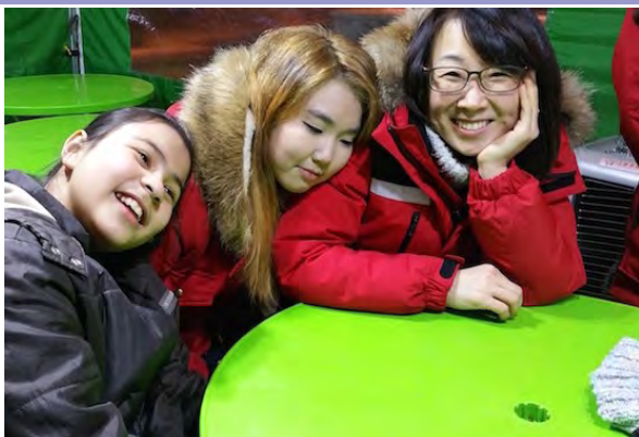
Two teenagers with an AGIT volunteer (right) inside the charity program's tent. Twice a week volunteers go out to help Seoul's homeless youths.