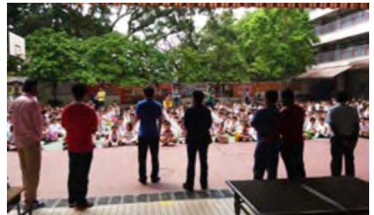
With students at an Oblate-run school

The participants would like to thank the China-Hong Kong mission and our mission partners for making this encounter a memorable one.