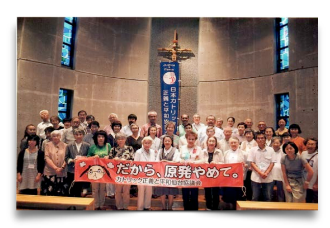
Study Tour Participants

Finally, we may make use of the media and other sources to know what is happening in the northeast, but its nothing like seeing and listening to the cries of the people living in the disaster affected areas. For me it was worth making a trip. A word of thanks to the Catholic Justice and Peace Conference of Sendai for a well organized study tour.