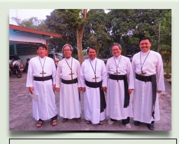
Some of the Indonesian Oblates. Young! (second from left is the Provincial)

They have a number of juniors, novices and scholastics. Most of the native Oblate priests are young. It is a small unit that is slowly growing amidst the colorful blend of different religions.