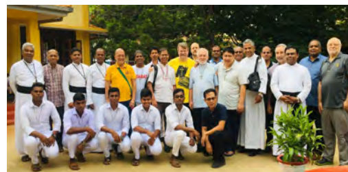
Visit to the Pre-Novitiate community