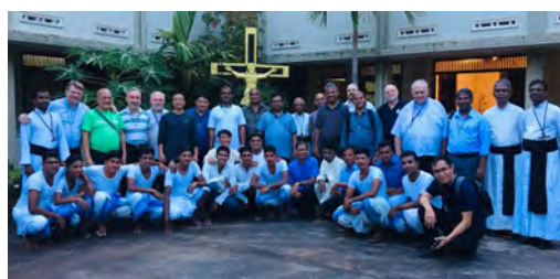
With the Scholastics

All units were represented except South Korea, as Korea had imparted travel restrictions due to the coronavirus outbreak.