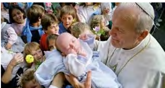
St. John Paul II, pray for us

We were blessed to meet experts who preached the gospel of life based on scientific principles. In addition, we were also inspired by the lives of those who proclaimed the culture of life through their real-life testimonies. It was encouraging to see hundreds of Asian delegates gathered to-