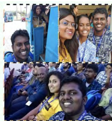
left to right: 600+ Delegates, daily Mass, Young People

India has one of the highest abortion rates in the world. The alarming 15.6 million Indian abortions put the country on a par with communist China and its forced abortion policy. Fully one-third of all babies conceived are killed before they see the light of day. Like other countries, sex has become just another pleasurable pastime leading to many social problems as seen in ASPAC 2020.