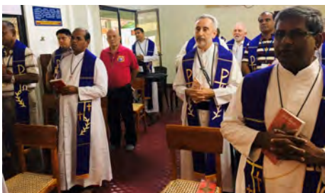
Celebration of the Eucharist

Apart from the talks, reports and discussions, we also had time for prayer, sharing, recreation and some sightseeing. Thanks to the Provincial of Jaffna and the Oblates of the Province of Jaffna for their hospitality and kindness.