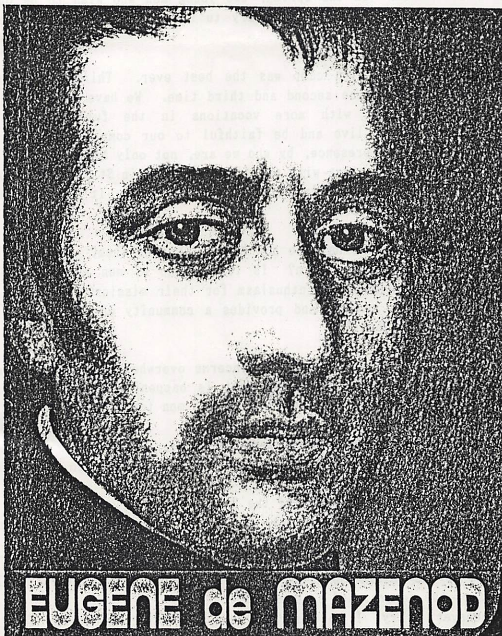
EUGENE de MAZENOD

Bishop Eugene De Mazenod, OMI Founder of the Missionary Oblates of Mary Immaculate