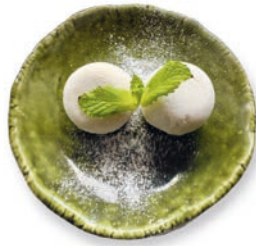
MOCHI ICE CREAM 4 Vanilla / Matcha / Chocolate