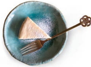
YUZU CHEESE CAKE 6