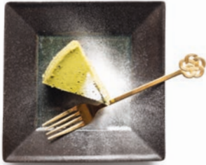
PREMIUM MATCHA CHEESE CAKE 6