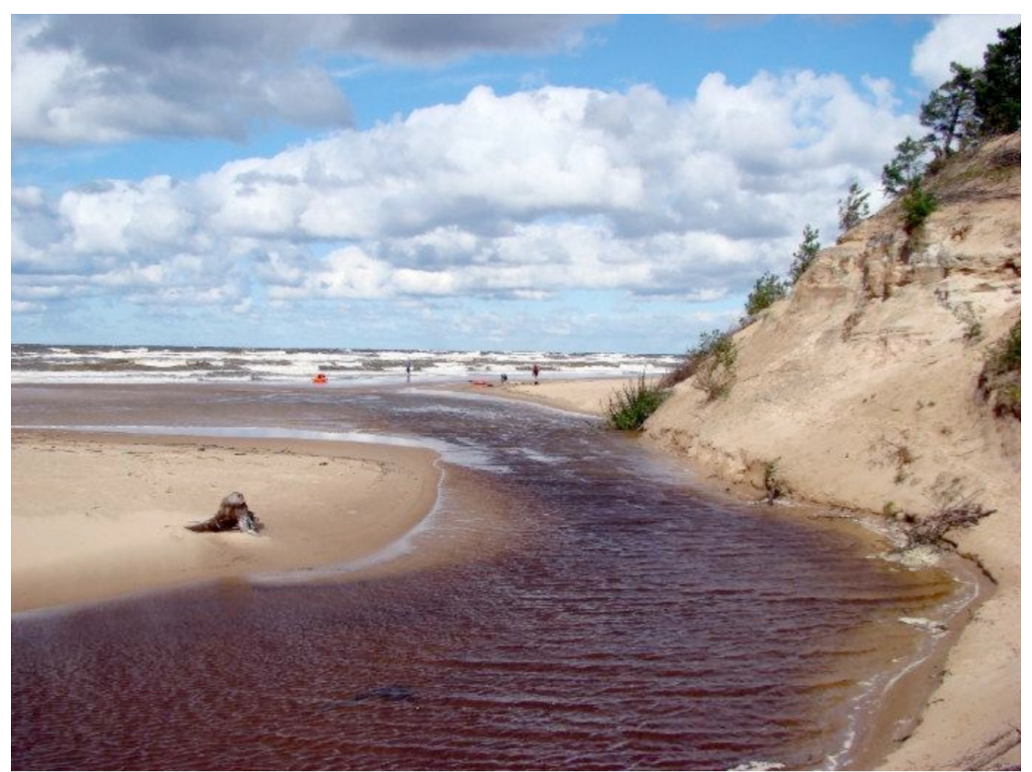
Saulkrasti, Latvia - warm and welcoming

Newsletter with the latest updates. Having problems reading it? View in browser.