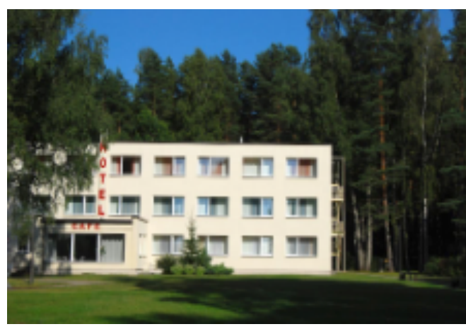
Or like the above here.

At the Riga Coach Station you should buy a ticket to Saulkrasti. The ticket costs around 2.55 EUR. The destination is a bus stop called "Koklītes" near "Minhauzena Unda", so you should ask the bus driver where to get out. You will notice a road sign like the one on the left.