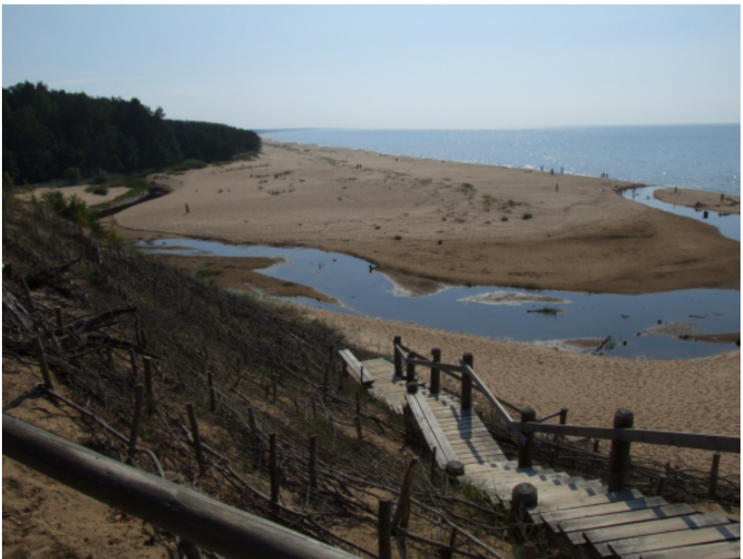
Sandy beach at your doorstep in Saulkrasti, Latvia