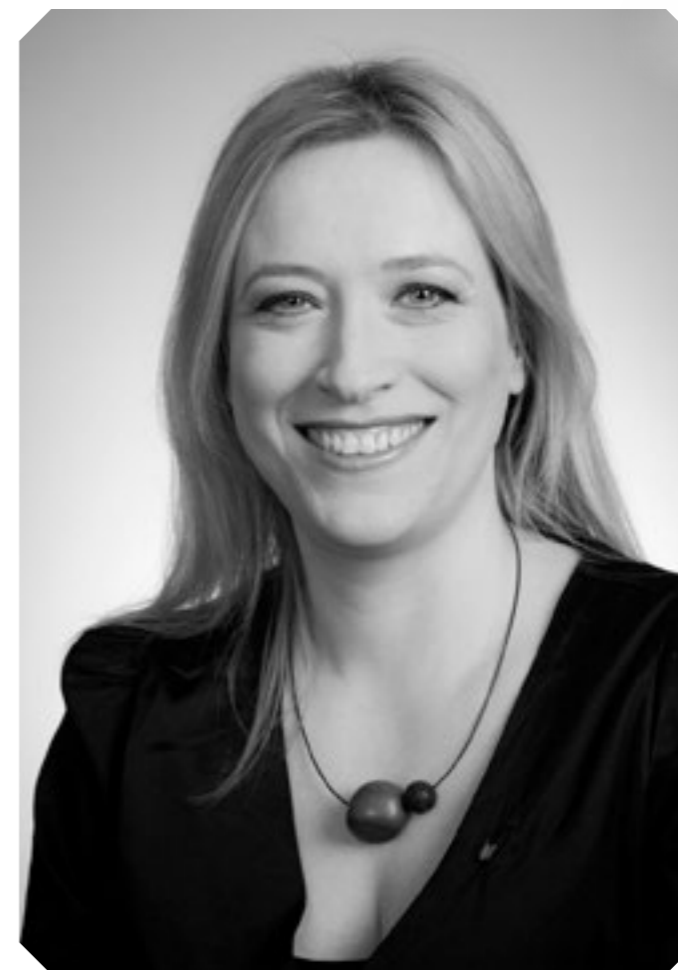
Minister of Social Affairs and Housing, Eygló Harðardóttir will pay us a visit today out of interest and curiosity about NSU.

The advent of the visit by the Minister of Social Affairs and Housing today, Eygló Harðardóttir, gives Krækingur a great opportunity to introduce you to the Icelandic political landscape. The current seatholders at Alþingi were elected in the spring of 2013 forming the coalition government between the conservative Sjálfstæðisflokkurinn and the centrist Framsóknarflokkurinn. This succeeded the coalition between the social-democrat Samfylkingin and the left-green Vinstrihreyfingin grænt framboð. These four parties in addition to the liberal Píratar and liberal-democrat Björt Framtíð form the total parliamentary party participation.