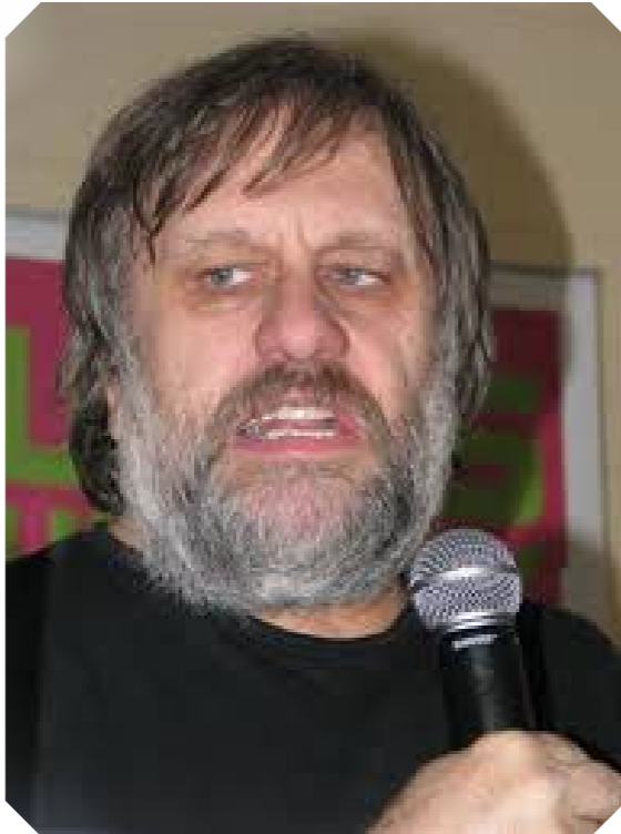
Slavoj Žižek with his beloved microphone.