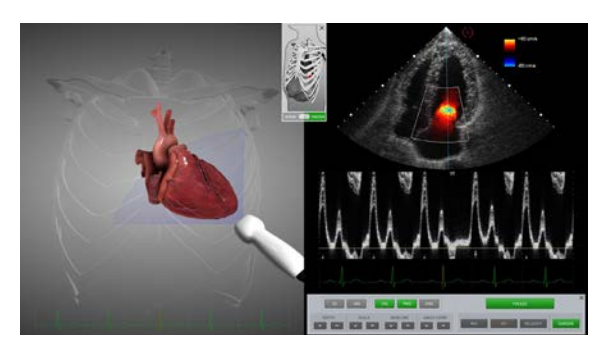
Mitral Regurgitation with Colour & Pulsed Wave Doppler

Colour and spectral Doppler modalities are available along with the tools with which to make accurate quantitative assessment of cardiac function. Pulsed and continuous wave Doppler information can be obtained from any intra-cardiac region.