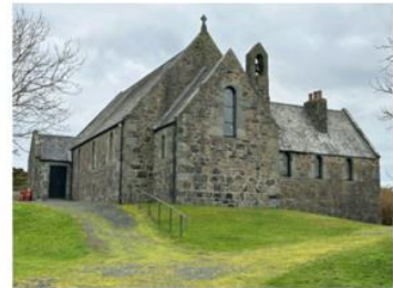
Gigha and Cara Church