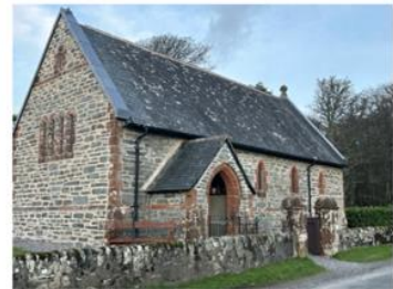
St Brendan's Church