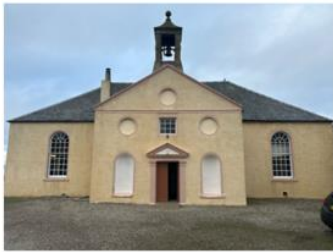
Killean and Kilkenzie Church