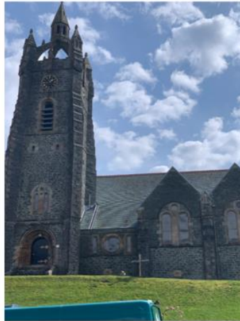
Tarbert and Kilberry Church