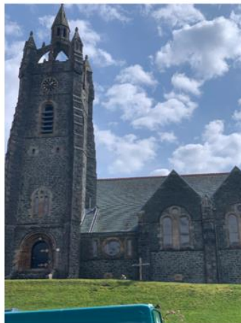
Tarbert and Kilberry Church