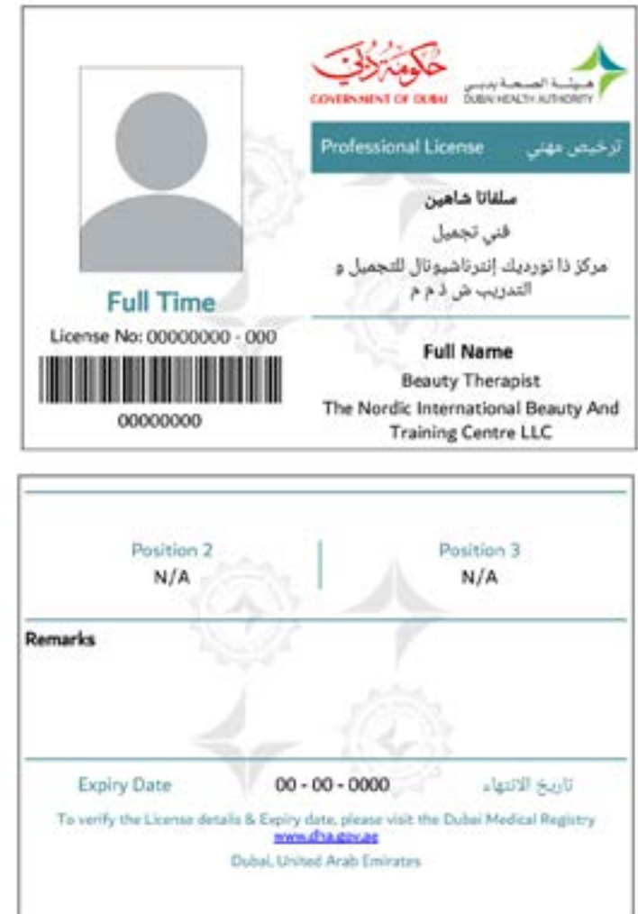
Sample of a DHA License.

We offer customized aesthetic, beauty therapy and skincare courses depending on your current level of knowledge, certificates and diplomas. We provide a full beauty, skin and spa therapy program which is required to be able to work in for example clinics and medical centers as a beautician