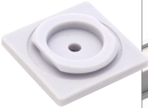
Rigid midway support for screen mount.