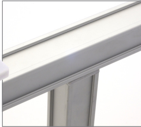
Vertical join to support a cantilevered lightbox.